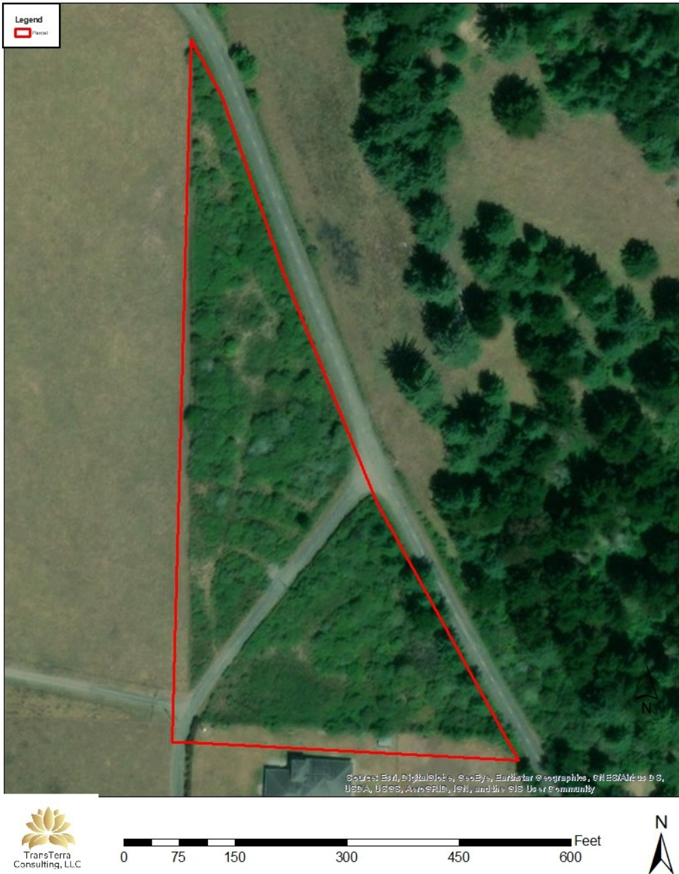
Figure 1. Aerial image of the Project Area and existing infrastructure

The County has issued two Stop Work Orders (SWOs) under Code Enforcement cases CE21 -0987 in December of 2021 and CE22-1518 in March of 2022. These Code Enforcement cases have been resolved with the application for a CDP filed in March of 2022. The SWOs were in response to major vegetation removal in the amount of approximately 12,000 square feet. The vegetation removal occurred prior to the field visits and botanical assessment.