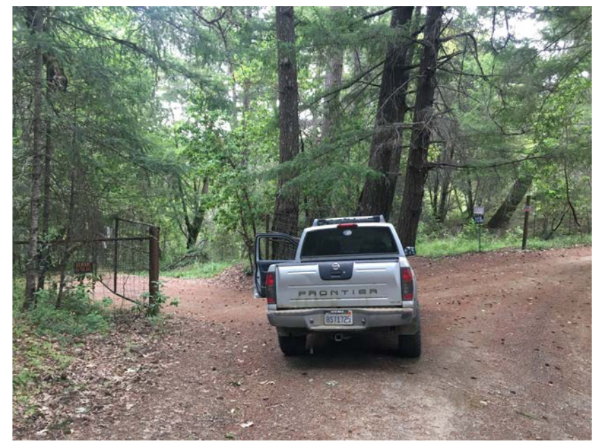
Mile Marker 9.1 Arrived at subject parcel gated entrance