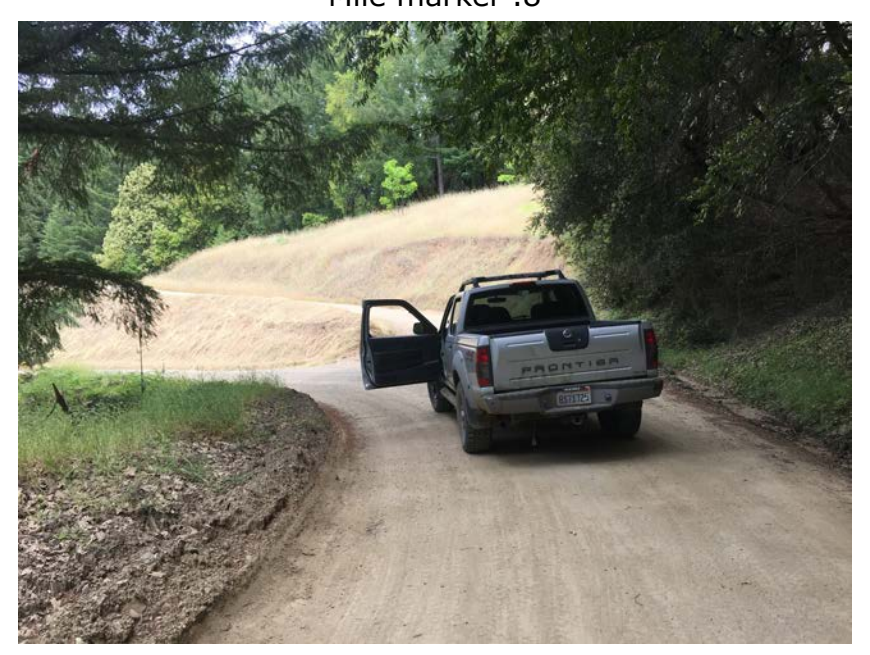
Mile marker .8

At each point which "pinches" along the roadway (images here show nearly all of the pinch areas), there is turnout space on one or both sides of the narrow stretch; the narrow stretches have visibility on approach by either direction. The road is passable by two vehicles for the entire distance, with minimal need for pullout for these short distances.