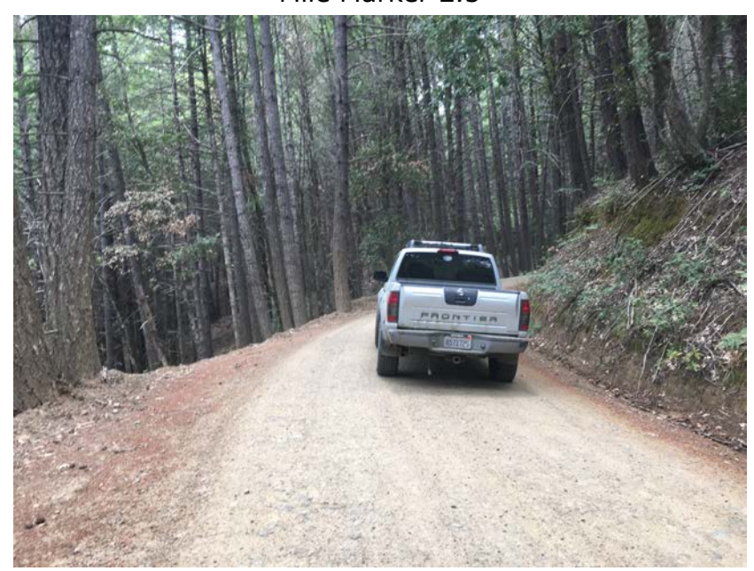
Mile Marker 2.5 reverse view