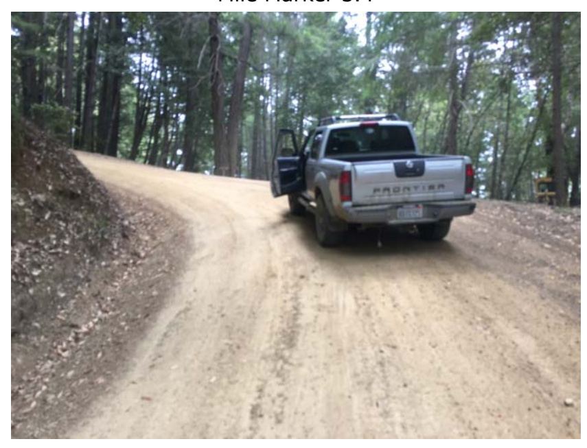
Mile Marker 3.4 reverse view