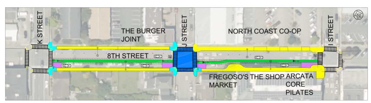
8th Street - Option 5A

Thank you for the opportunity to continue supporting the City of Arcata with the 8<sup>th</sup> & 9<sup>th</sup> Street Improvement Project. In Phase 1, two (2) alternatives for each street were identified. Our proposal is based on the understanding that 8<sup>th</sup> Street Option 5A and 9<sup>th</sup> Street Option 4B, show below, will be advanced to construction documents in Phase 2. We understand that improvements to the Co-op parking lot will be improved as a part of this project. The coordination with Co-op and the design of the parking lot will be performed by the City of Arcata. We understand that CSW|ST2 work will be limited to within the public right of way and we will coordinate with the City on the improvement conforms between the public and private improvements.