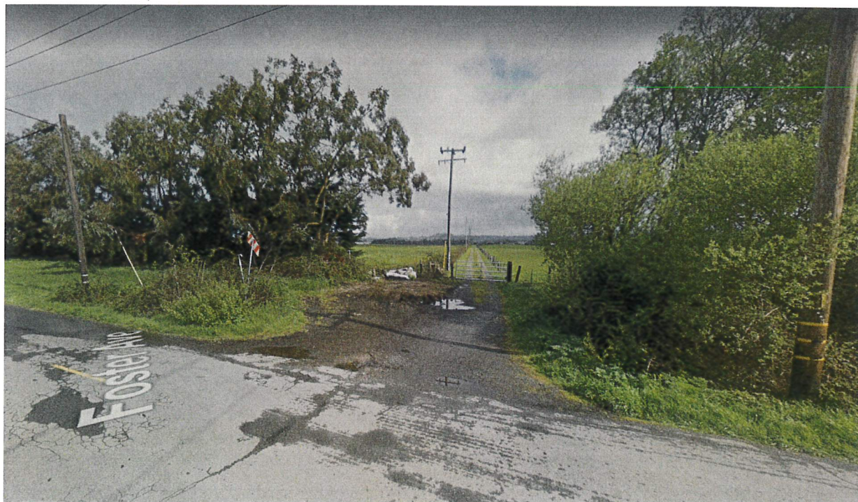
Photo of existing entrance onto Foster Avenue

SITE PLAN: No separate site plan was provided in the referral package, although a small picture was provided in the operations plan. It is unclear if the applicant will be utilizing the existing entrance on Foster Avenue, preferred, or creating a new entrance location further to the west.