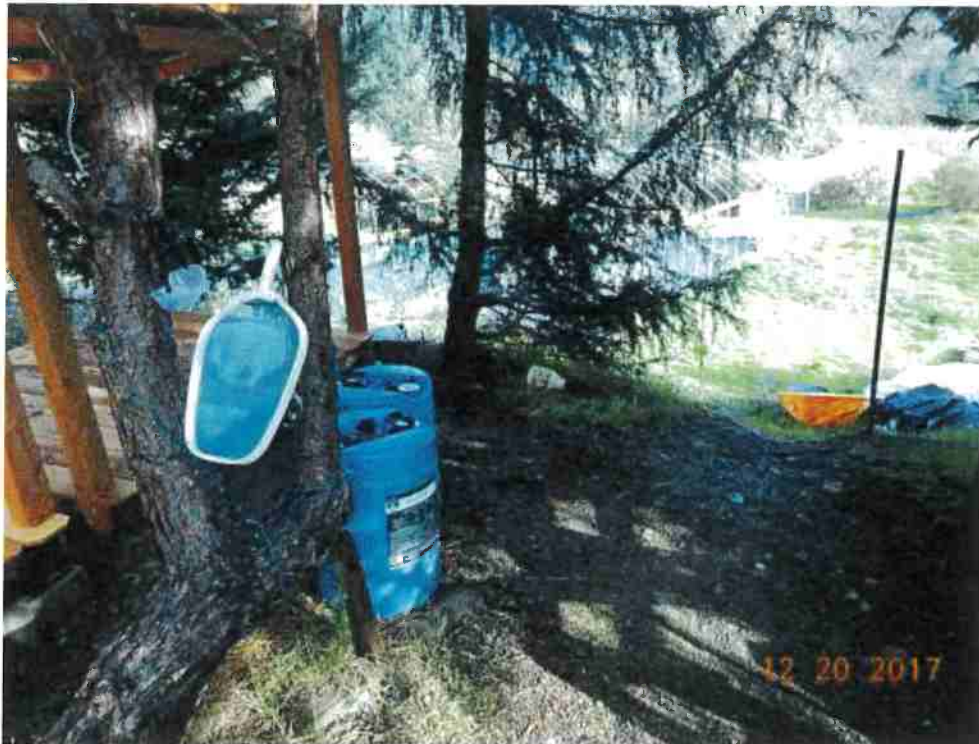
Photo 10. Looking down path to eastern cultivation area