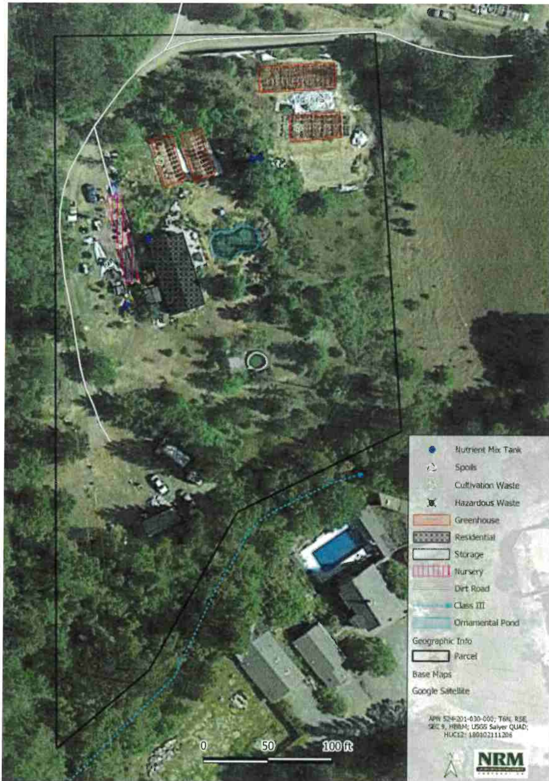
Figure 3. Property Map (Google Satellite)