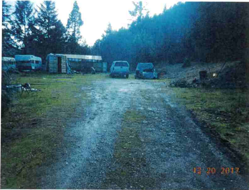
Photo 3. Southern flat - parking area, shipping container has been removed