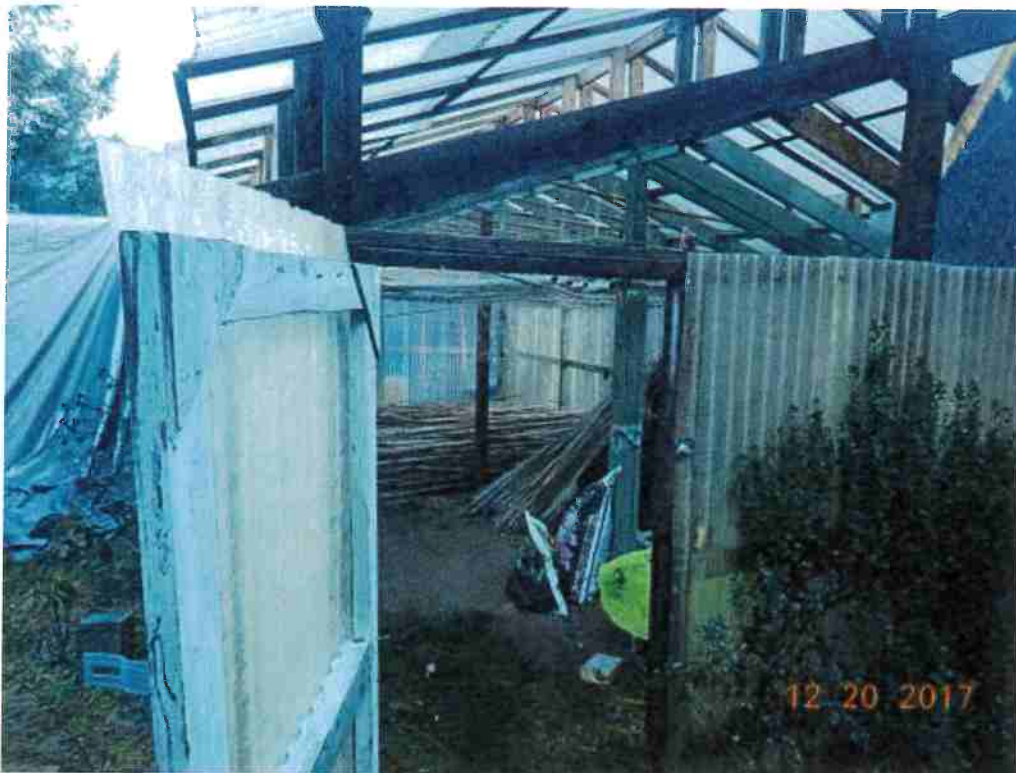
Photo 4. Inside of southern storage building