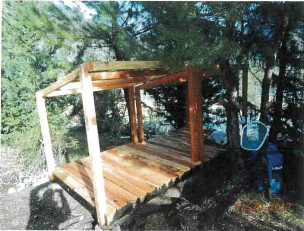
Photo 9. Wooden platform with concrete foundation for nutrient mixing reservoirs