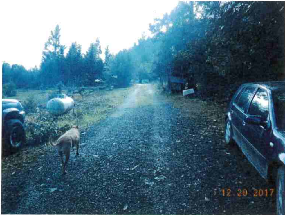
Photo 2. Road leading up to southern flat