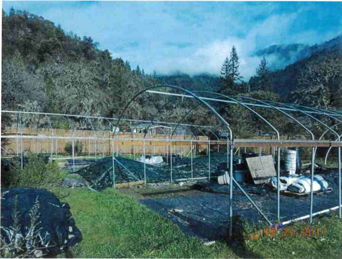
Photo 11. Eastern cultivation, looking NE