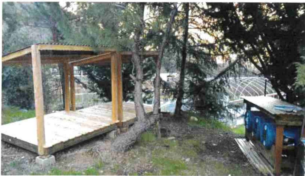
Photo 8. Nutrient storage during cultivation season, containment to be applied – 2/13/18