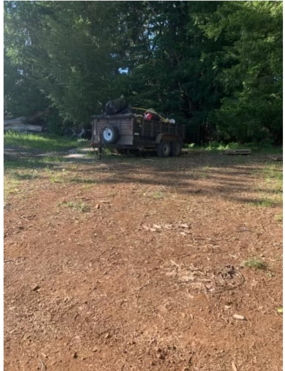
The decommissioned water bladders were cut up by hand and disposed of at Recology Waste Facility.