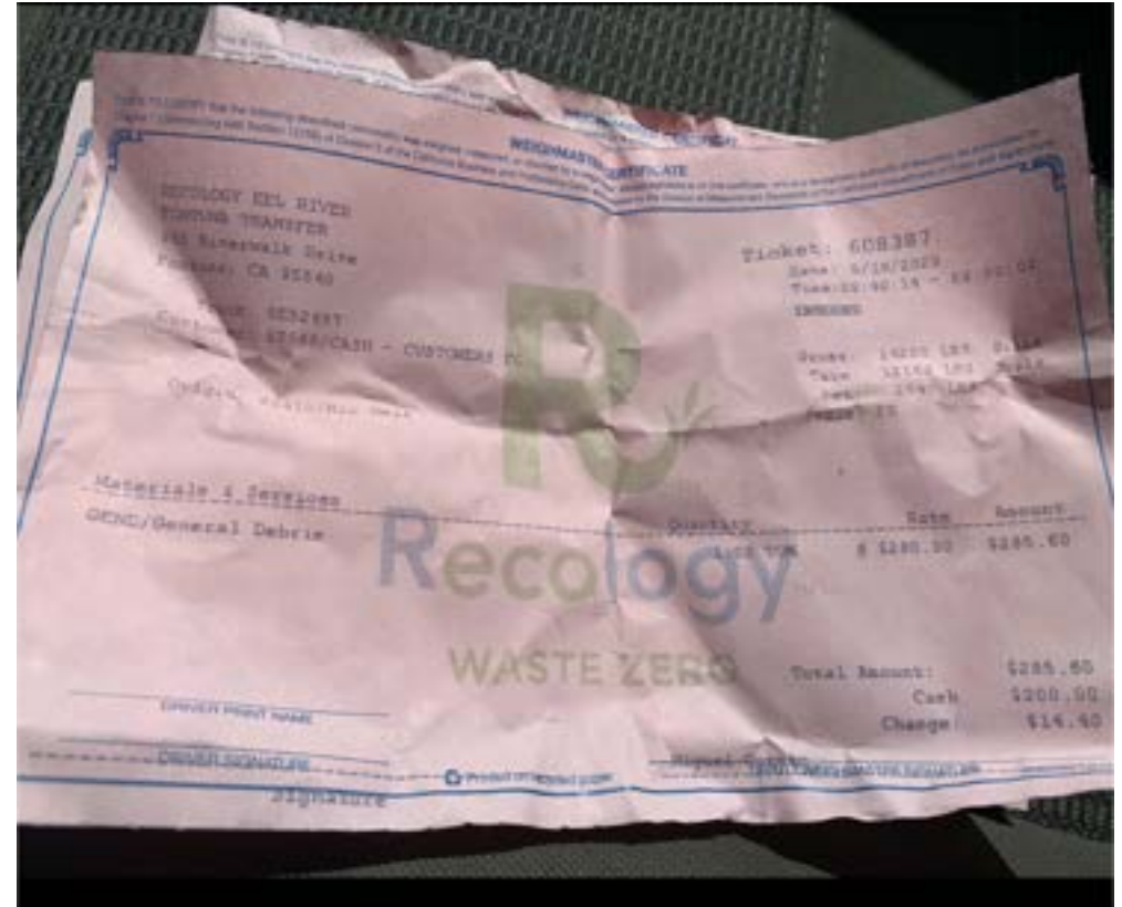
On 5/16/2023, 2,040 lbs of trash and bladder materials were disposed of.