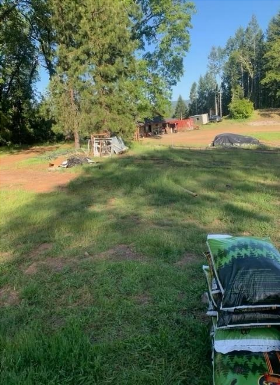
Trellis netting and trash has been cleaned up and disposed of properly.