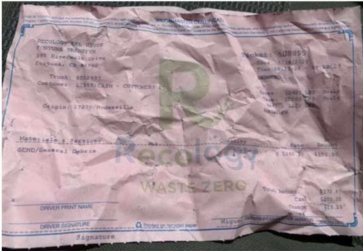
3 days later on 5/19/2023, 1,220 lbs of trash and debris were disposed of.