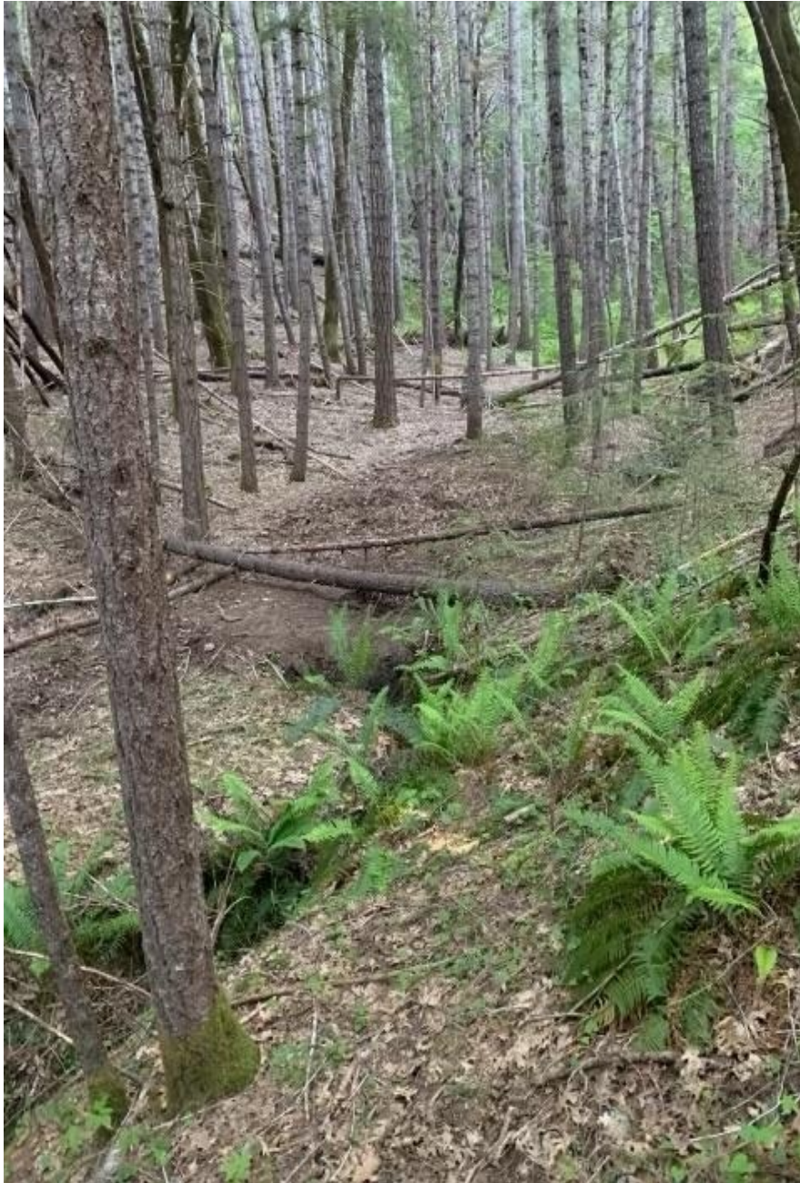
The decommissioned water bladders were cut up by hand and disposed of at Recology Waste Facility.