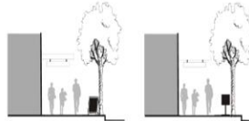
A-frame & Standing Signs