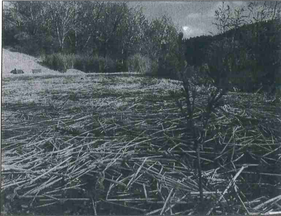
Photo 1: Redwood trees planted on the south side of the grassy opening at a spacing of 10 feet by 10 feet. (Photo looking to the east.)