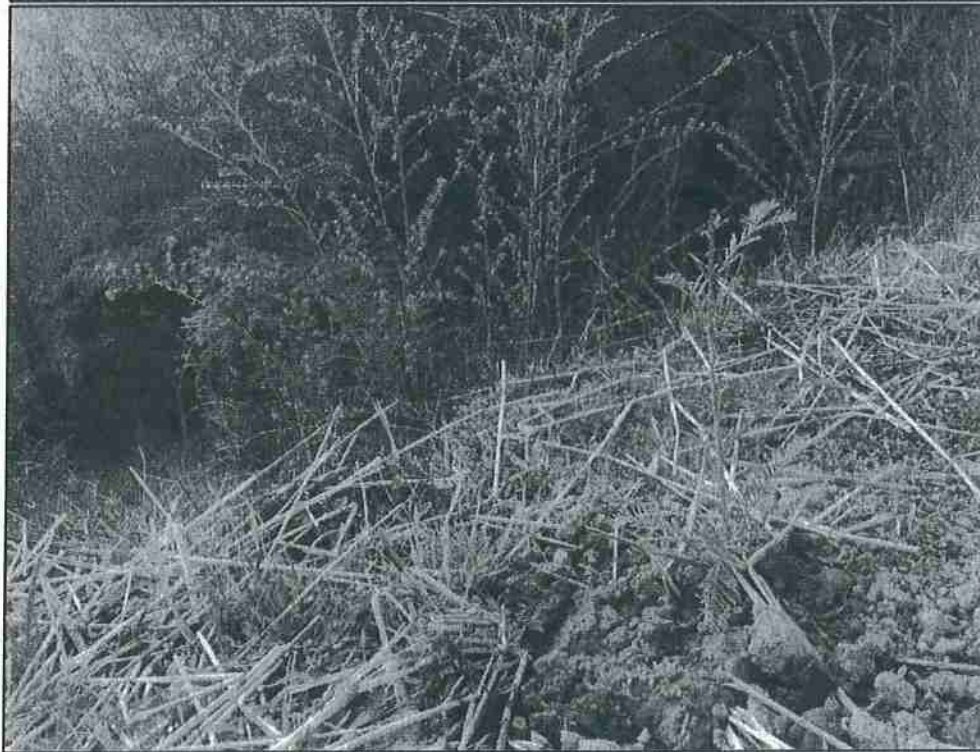
Photos 3 & 4: Redwood trees planted on the south side of the grassy opening and adjacent hillslope.