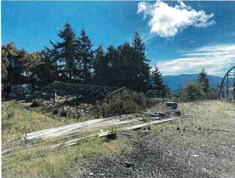
Photo 3. Looking southeast from Conversion Site #2 toward Conversion Site #1.