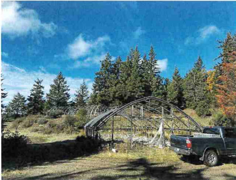
Photo 1. Looking northwest from Conversion Site #1 toward Conversion Site #2.