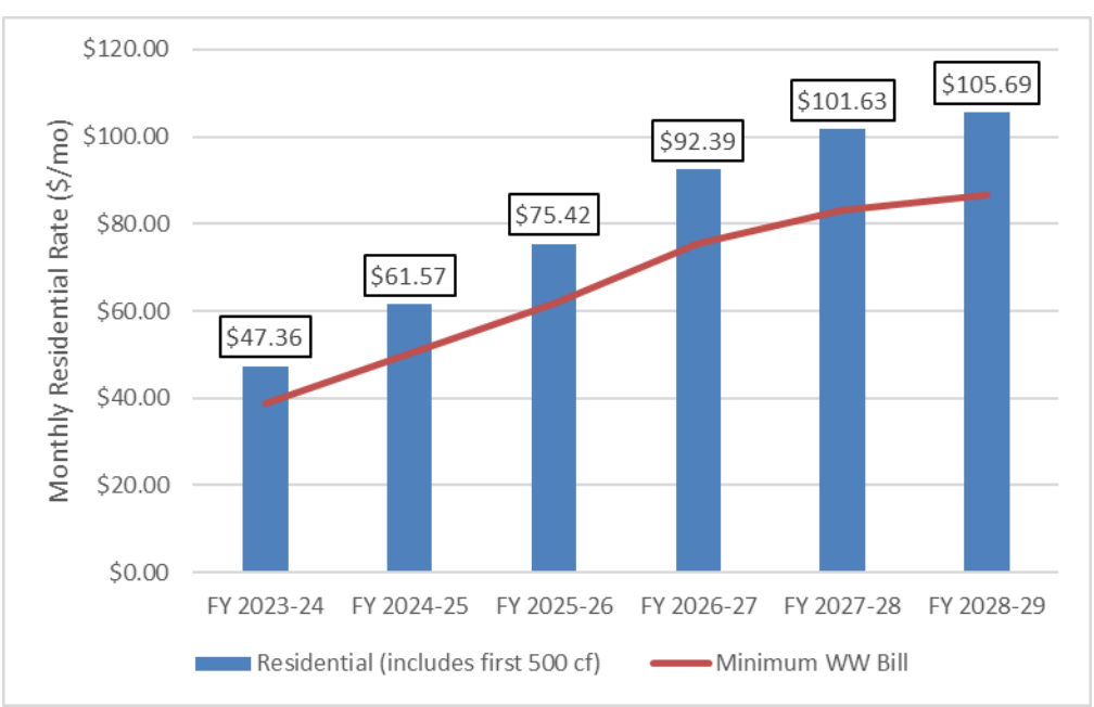
Figure 2. Average and minimum project monthly wastewater bills.

Table 3 below shows the average total user bill in the current year, and over the next 5 years of the proposed adjustments. Overall, as per the Council's direction the annual increases are uniform, and continue further into the planning period.