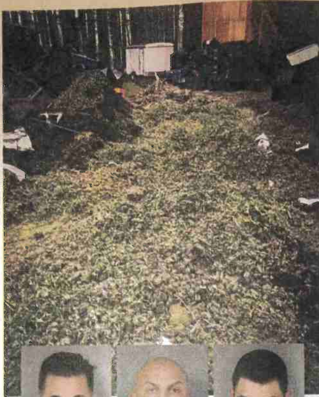
Mug shots of the three men accused in the heist plot, Brooks, Borisov and Kopankov, inset in a picture of a marijuana bud pile from the Nov. 27 bust at a property in Southern Humboldt that may be connected to the failed plan to allegedly kidnap, rob and torture a Humboldt County grower.

Both men had been released from federal custody and Brooks' detention