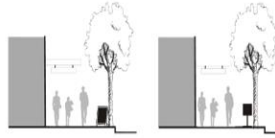
A-frame & Standing Signs