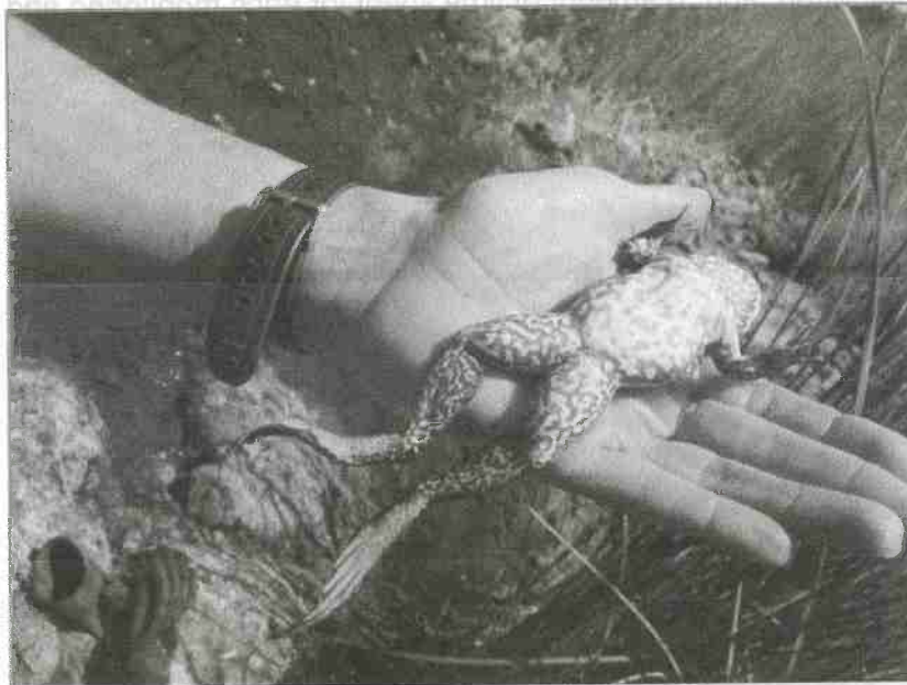
The bullfrog has somewhat distinct mottling and the underside of the bullfrogs hind legs are not shaded pink or red.