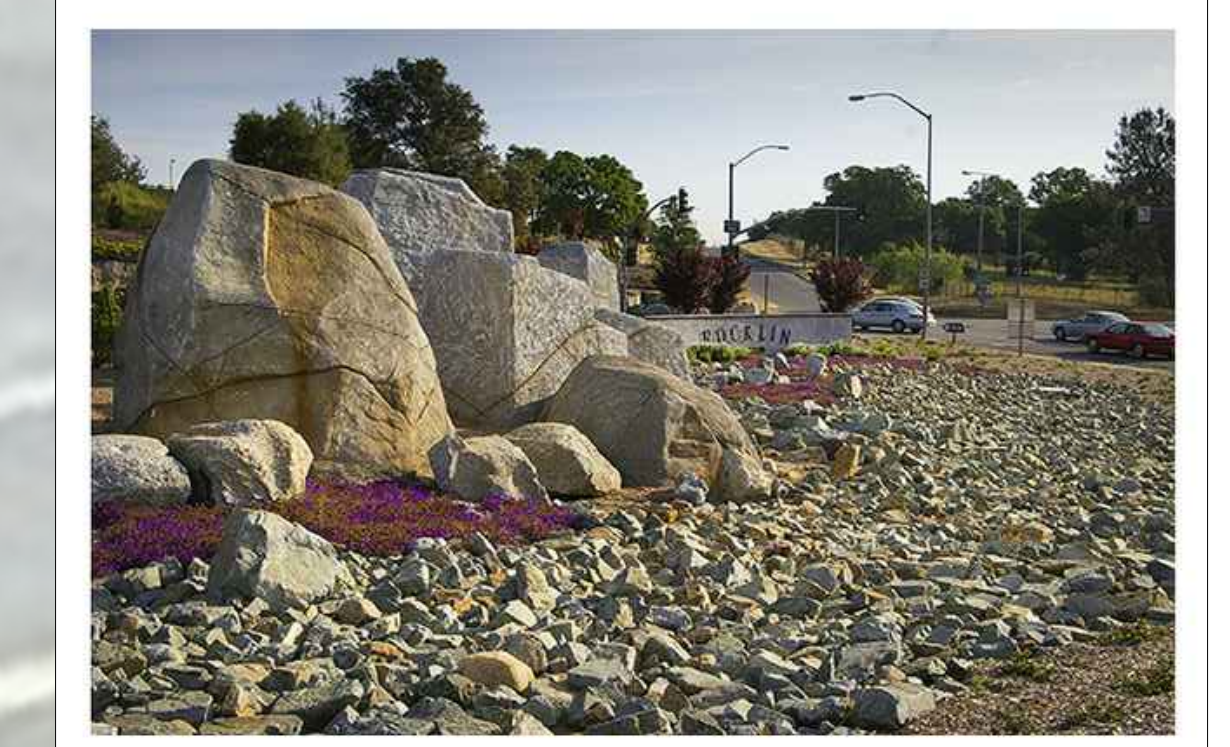
LOW BOULDER EXAMPLE