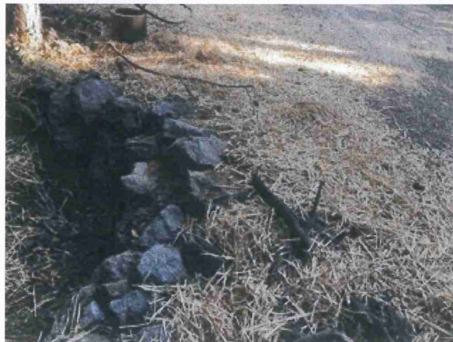
Picture 8 & 9: Crossing #3's inlet (top). Crossing #1's inlet in the process of Erosion Control being applied. (bottom photo was provided by the Applicant on 11-12-2020.)