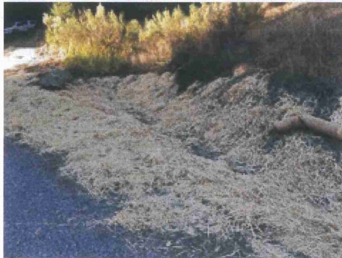
Picture 1 & 2: Crossing #1's inlet (top). Looking upstream from Crossing #1's inlet in the process of Erosion Control being applied. (bottom photo was provided by the Applicant on 11-12-2020.)