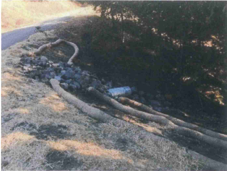
Picture 4: Crossing #1's outlet in the process of Erosion Control being applied. (photo was provided by the Applicant on 11-12-2020).