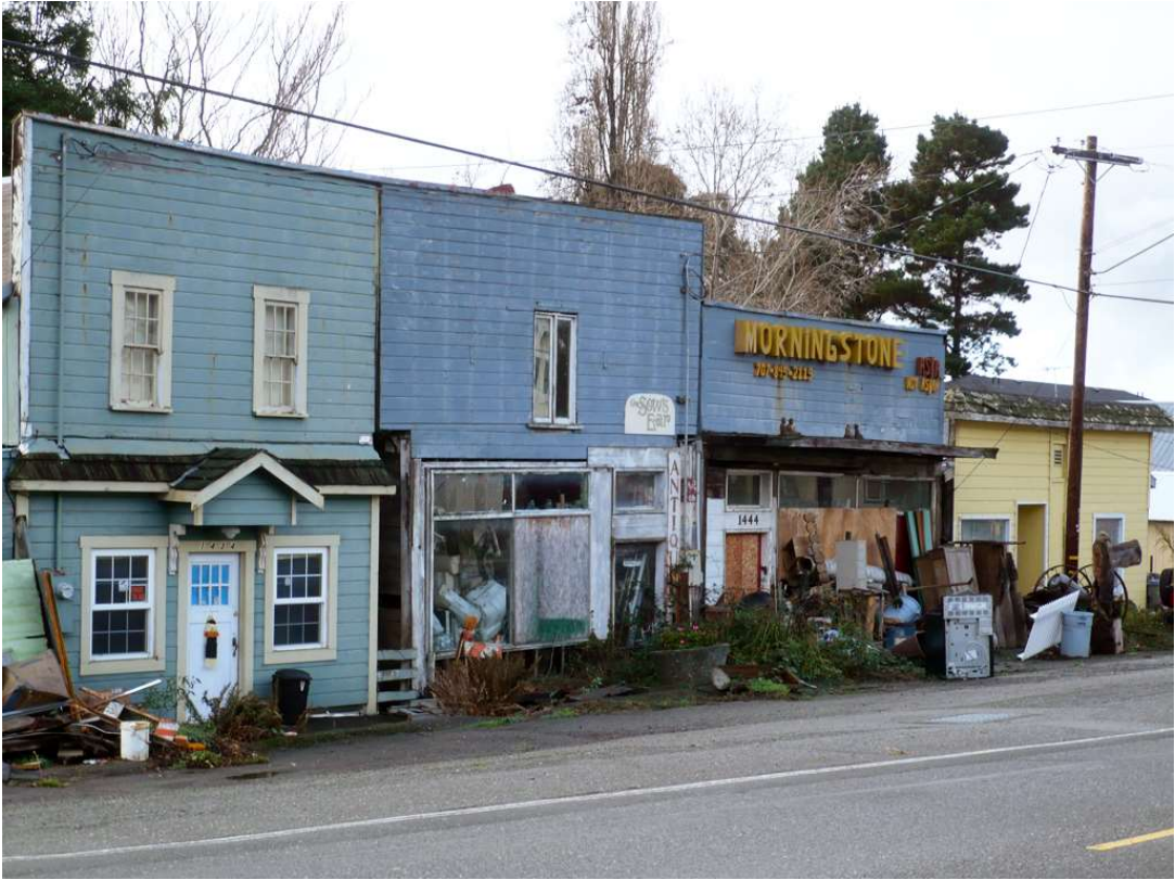
Photo of the property in a nuisance condition prior to the new sidewalk construction.