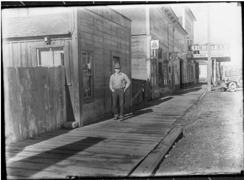
A historical photos of the vicinity in the early 1930's.

The property located at 1434 Rohnerville Road comprises a large part of what historically was the commercial district developed in the 1800's as Rohnerville. Rohnerville pre-dated the incorporation of the City of Fortuna and was ultimately annexed as part of the City of Fortuna. A large portion of Rohnerville was lost to fire in the 1890's and again around 1940.