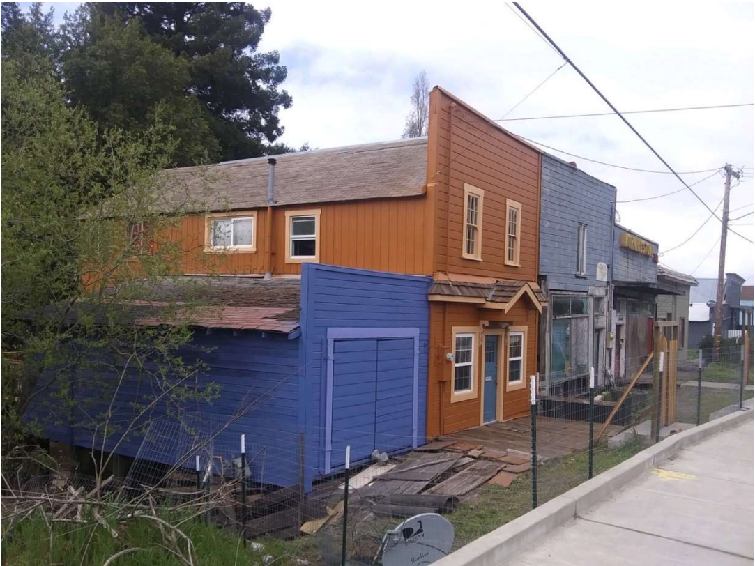
Photo of the Property in its current condition after purchase by Mr. Allen