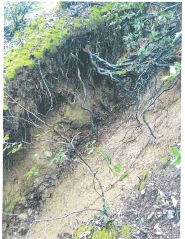
Erosion below discharge point.