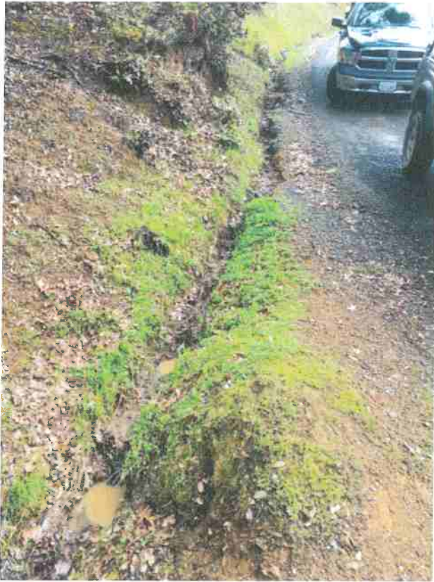
Inboard Ditch at Eubanks Road