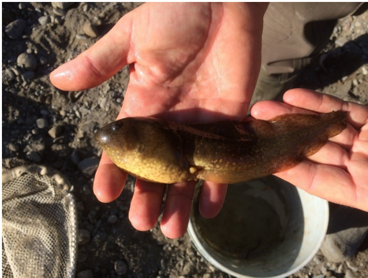
This is a photo of a Bullfrog tadpole.