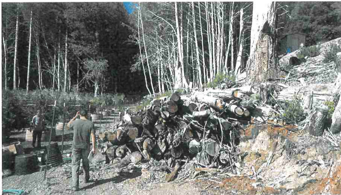
Photograph IMG0113: View of logs from clearing of trees within Conversion Area.