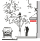
Under Canopy Signs