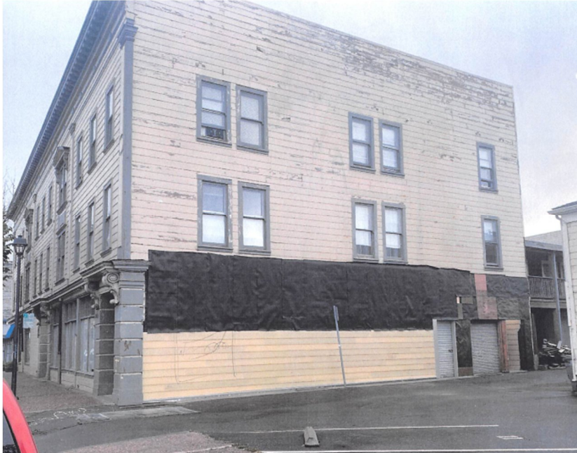
Figure 2: South-facing building façade (facing north east from D Street)