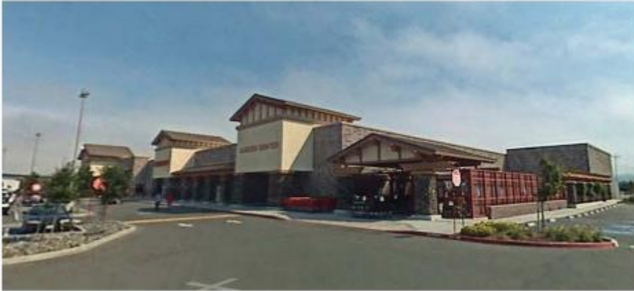
Figure 4: Existing Target Store

The front entrance of the building facing the Target parking lot will have large clear glass windows and doors inside bronze anodized aluminum frames (Figure 5). There is a wood awning over the sidewalk, roofed with gray composite shingles and supported by stone veneer columns. Stone veneer accents are found throughout the building façade. There are three raised roof areas (north, south and east sides) which are trimmed in stained wood and supported by stone veneer columns. Decorative light fixtures are proposed for each of the stone columns. The remainder of the building will be smooth painted plaster with stained wood accents. All tenant signs will be approved under a separate application.