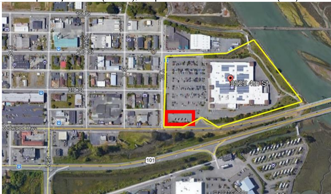
Figure 1: Location Map- Project Area (Yellow), Proposed Location of Restaurant (Red)