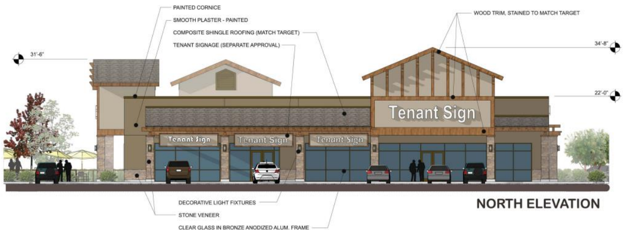
Figure 5: Conceptual Elevation- Building Front (Facing Parking Lot)

The front entrance of the building facing the Target parking lot will have large clear glass windows and doors inside bronze anodized aluminum frames (Figure 5). There is a wood awning over the sidewalk, roofed with gray composite shingles and supported by stone veneer columns. Stone veneer accents are found throughout the building façade. There are three raised roof areas (north, south and east sides) which are trimmed in stained wood and supported by stone veneer columns. Decorative light fixtures are proposed for each of the stone columns. The remainder of the building will be smooth painted plaster with stained wood accents. All tenant signs will be approved under a separate application.