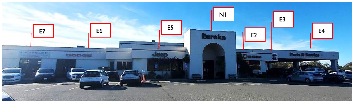
Figure 3: Street view taken November 28, 2023 (see Table I below for the sign inventory)

The applicant is requesting approval to utilize six existing nonconforming signs (five wall signs and one pole sign), one new nonconforming wall sign installed without the benefit of permits and one existing projecting blade sign (E3) which conforms to the current sign standards (a total of eight signs), at the Eureka Chrysler Dodge Jeep Ram FIAT dealership (Eureka dealership) at 4320 Broadway. Because all of the wall signs and the pole sign deviate from the current City sign standards, the entire site requires approval of a Master Sign Program through a Master Sign Permit.