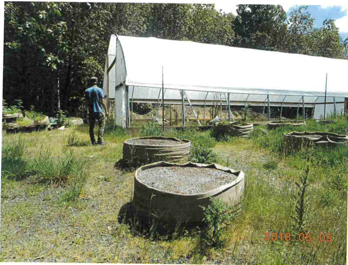
Cultivation Area A – Greenhouse proposed to be relocated