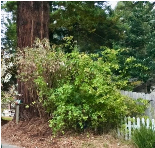
Exhibit A – New pathway from street parking, as requested by Planning Staff, Before & After