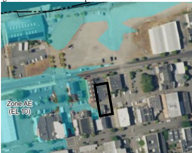
Figure 5: FEMA Flood Map – 220 First Street

The project site is located slightly outside of the FEMA mapped 100- and 500-year flood zones, although, Zone AE appears to be directly adjacent to, and potentially touching, the west side of the building (Figure 5). The building is located within the mapped tsunami inundation area on the Tsunami Inundation Map for Emergency Planning (Figure 6; California Geological Survey, August 13, 2020) and is at risk of tsunami inundation.