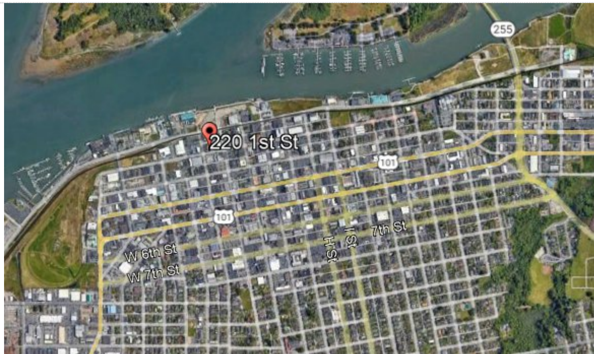
Figure 1: General Project Location– 220 First Street