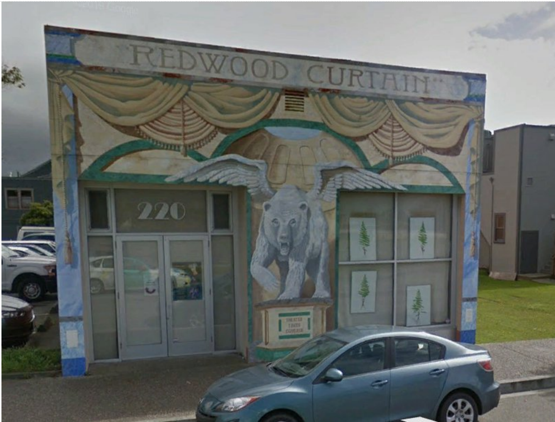
Figure 3: Storefront – 220 First Street

HAR plans to remodel the interior of the existing building, (Figure 4), and repair, regROUT, seal, and paint the exterior, including the front facade and mural (Figure 3). HAR plans to engage a local artist to paint a mural on the building side adjacent to the public parking lot. No ground disturbing activity is anticipated. The primary office hours will be Monday-Friday 9 a.m. to 5 p.m. Based on current operations at their Wabash location, foot traffic on an average week is 150-200 people and may increase to 300-350 people at the new location.