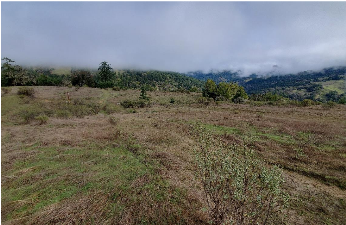
Photograph 4. The ephemera drainage south of the BSA, facing northeast.