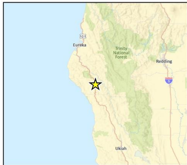
Fig 1 Regional Location