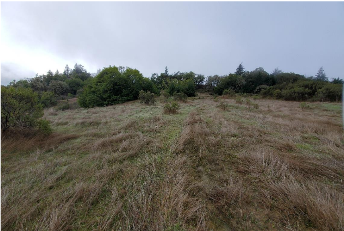
Photograph 2. The east side of the BSA, facing west.