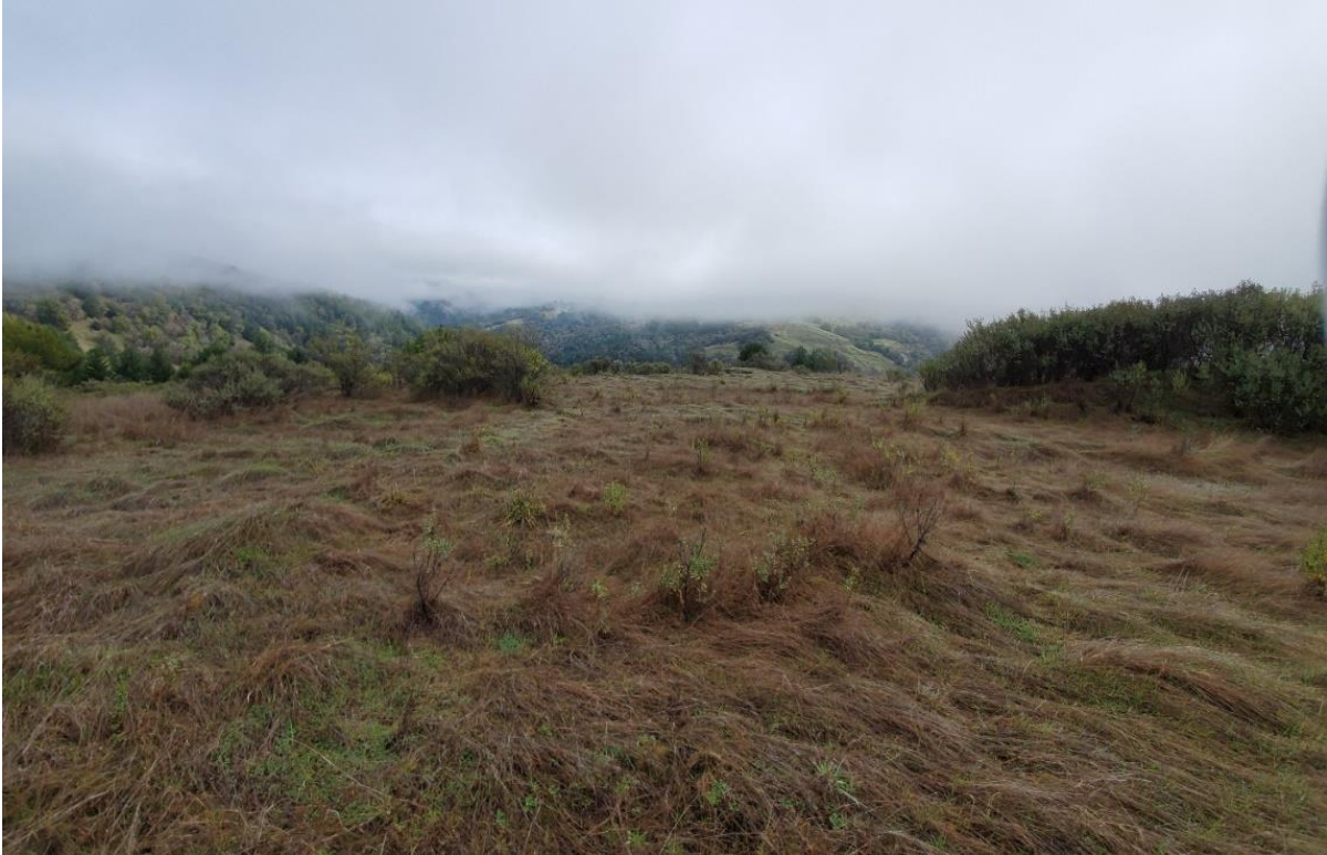
Photograph 1. The west side of the BSA, facing east.