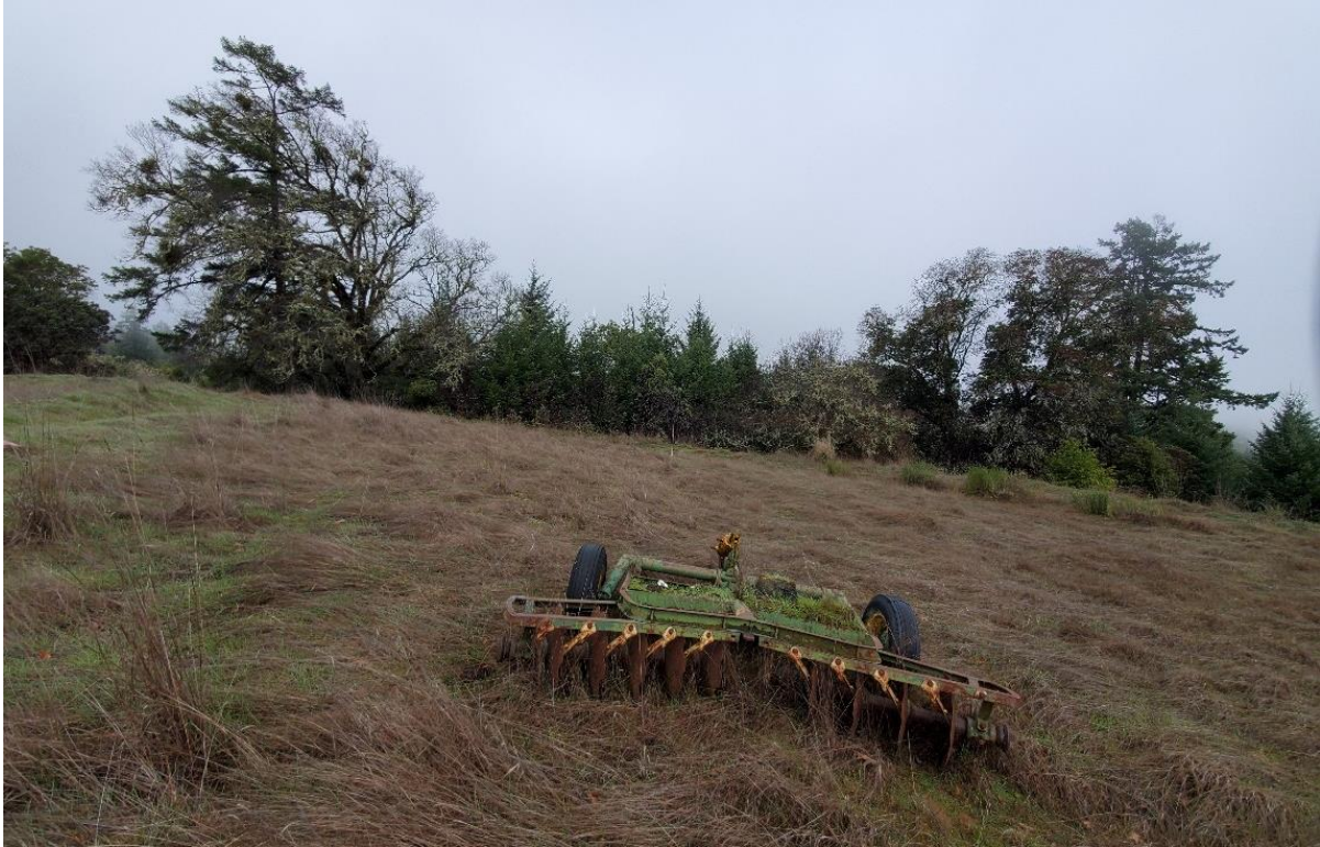
Photograph 3. The west end of the BSA, facing north.