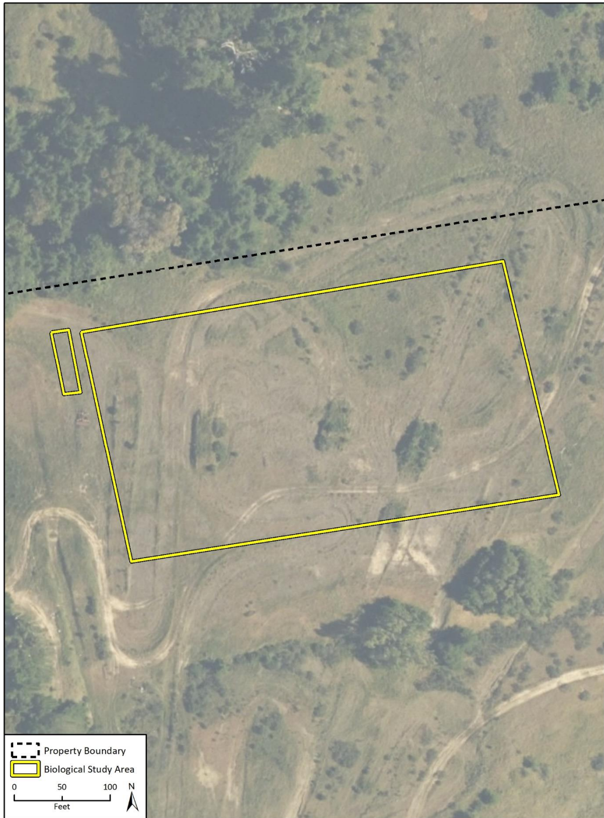
Figure 2 Biological Study Area