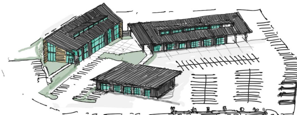
Figure 3: Conceptual Site Layout

See the IS/MND (Attachment 2) for a detailed description of the proposed operations complex.