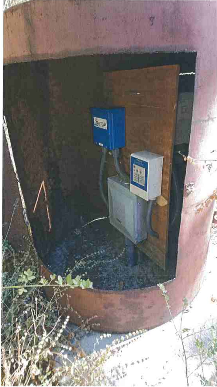
Picture 3: Old Groundwater Well which provides adequate water but is unpermitted. This equipment will be transferred onto the New Groundwater Well. Photo date: 8/15/2019.