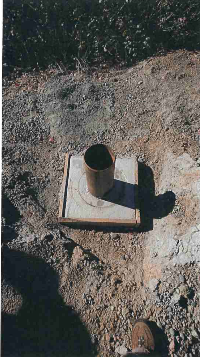
Picture 2: Recently drilled, permitted groundwater well which will be the sole source of water for the entire property. Photo date: 8/15/2019.