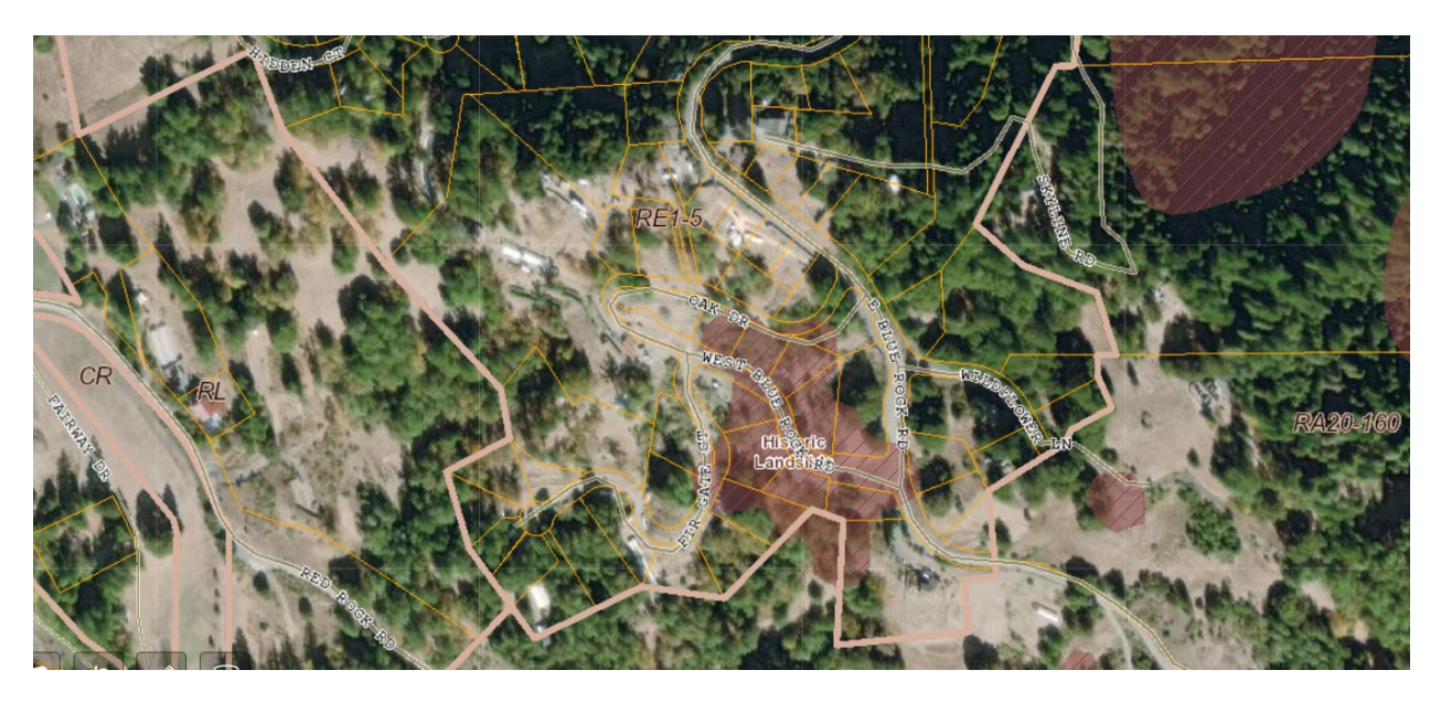
FIGURE 3 - HISTORIC LANDSLIDES AND LAND USE DESIGNATIONS

Project Area contains historic landslide feature