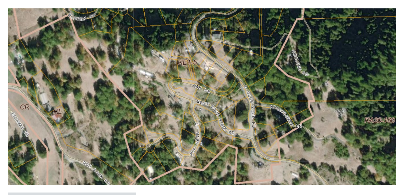
FIGURE 4 - 2019 RHNA HOUSING INVENTORY AND LAND USE DESIGNATIONS