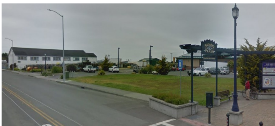
Figure 3: Street view from Waterfront Drive and C Street looking northwest

inconsistencies for this parcel and several around it. For this parcel, the Local Coastal Program amendment changed the land use designation from Core Coastal Dependent Industrial [C-CDI] to Core Waterfront Commercial [C-WFC] to be consistent with it's Waterfront Commercial (CW) zoning. The purpose of the LCP amendment was to facilitate the "City of Eureka 'C' Street Projects" (CDP-07-0003) which included the following proposed redevelopment projects: