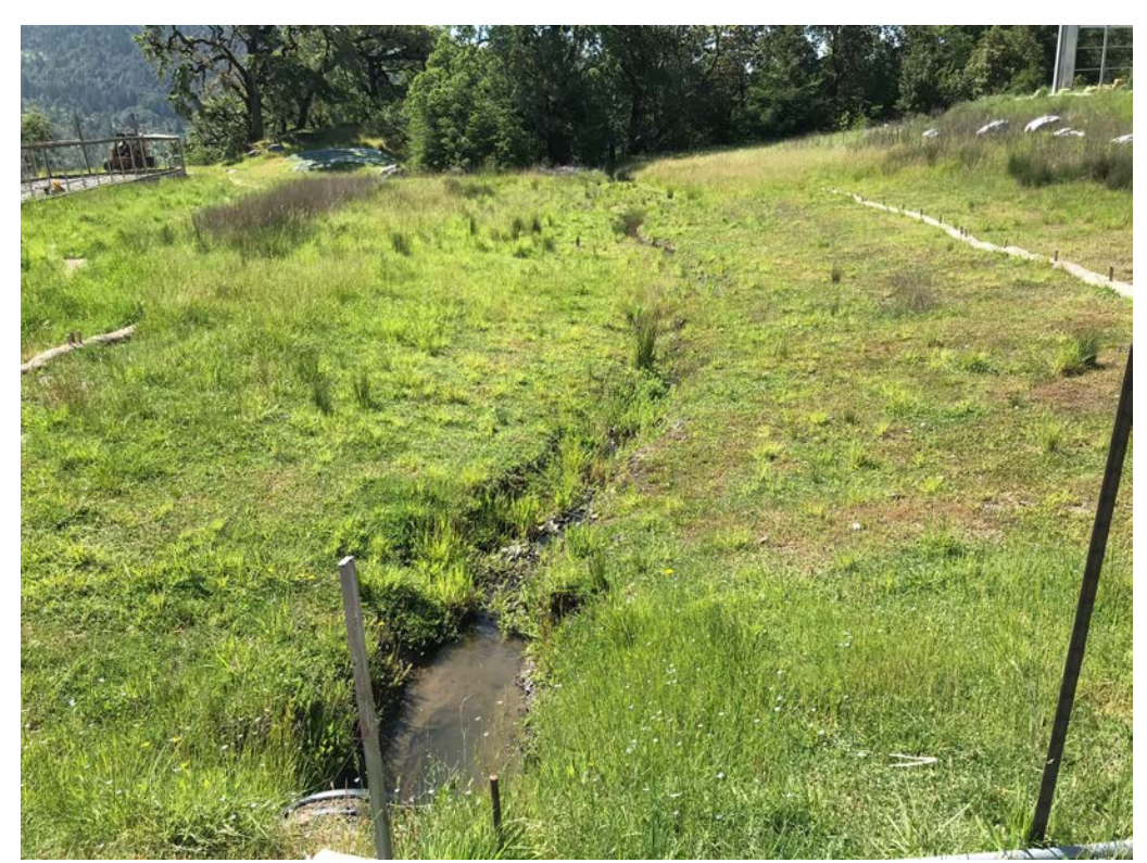
Photo 9. Intermittent stream through disturbed portion of Wetland 1, looking south from road.