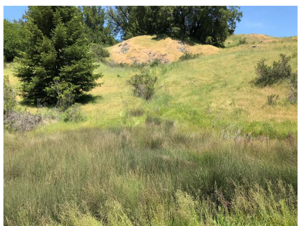
Photo 1. Ephemeral stream flowing into Wetland 1, looking north from near the road.