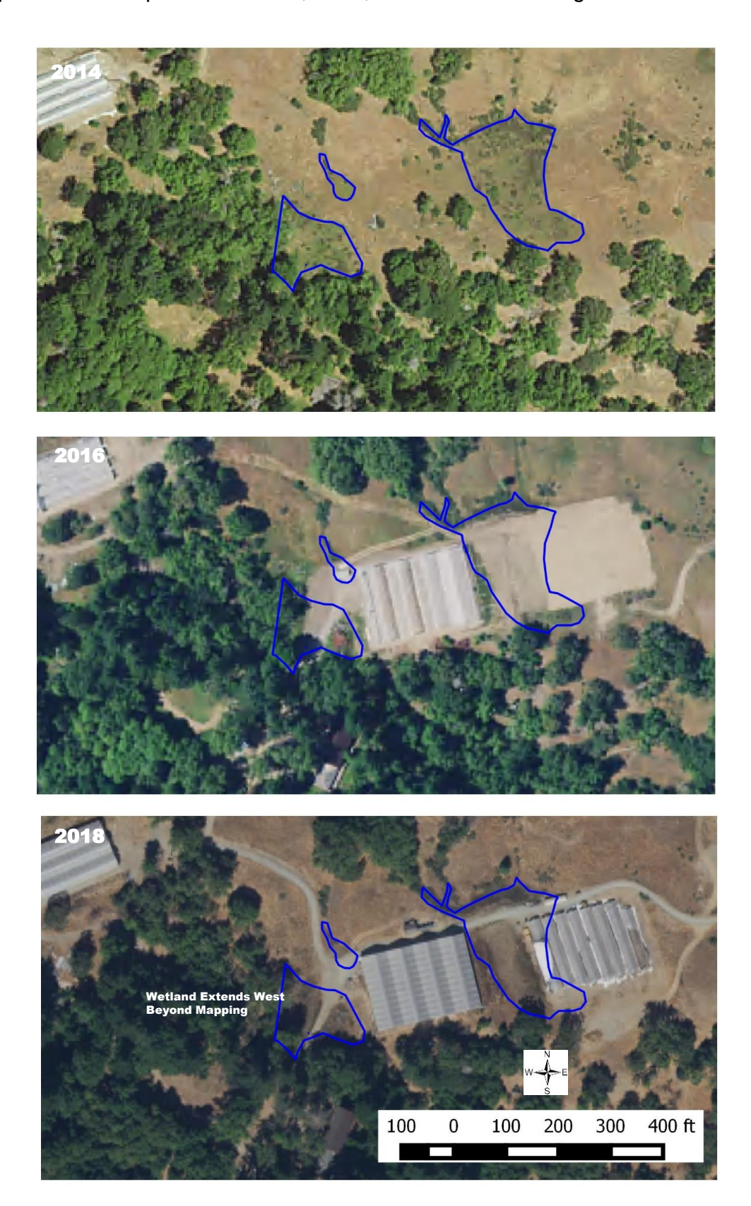
Appendix B. Comparison of 2014, 2016, and 2019 NAIP Images.