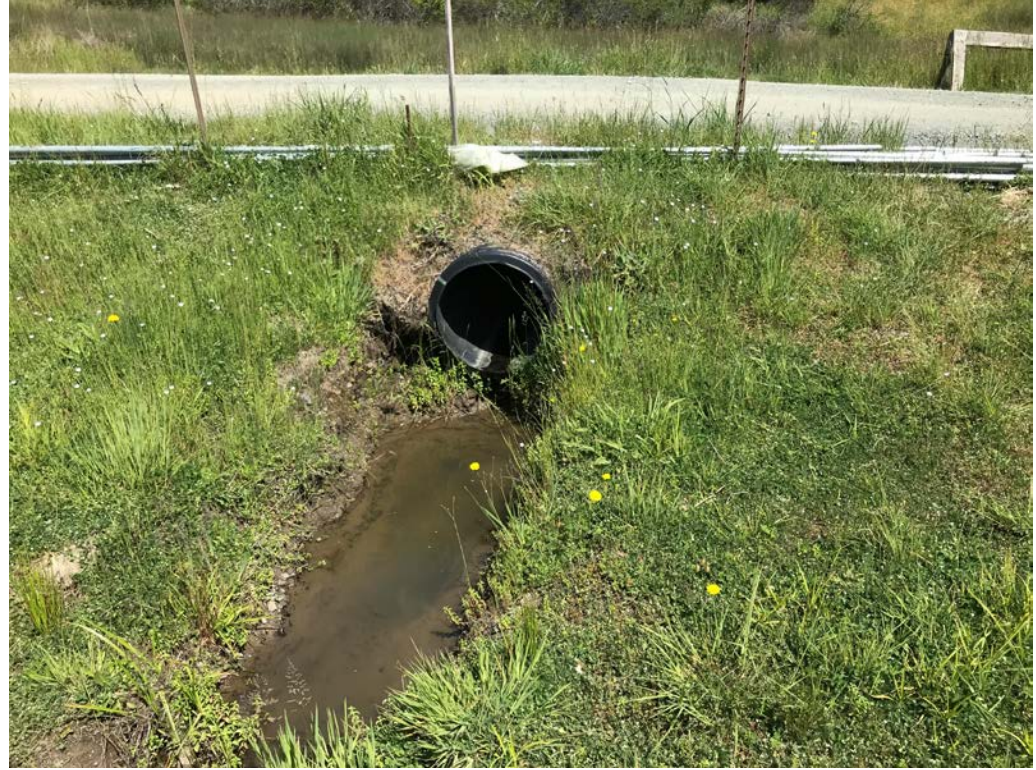
Photo 10. Intermittent stream through disturbed portion of Wetland 1, looking north.