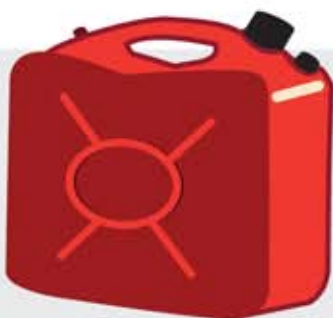
Gas and kerosene containers