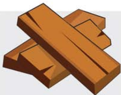
Lumber and large building materials