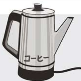
Appliances with Asian characters