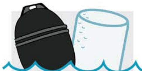
Fishing buoys: large black and large foamed plastic buoys