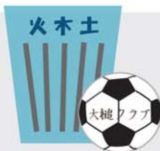
Household goods with Asian characters