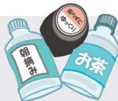
Plastic bottles with Asian characters