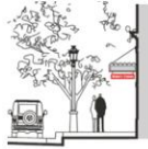
Under Canopy Signs