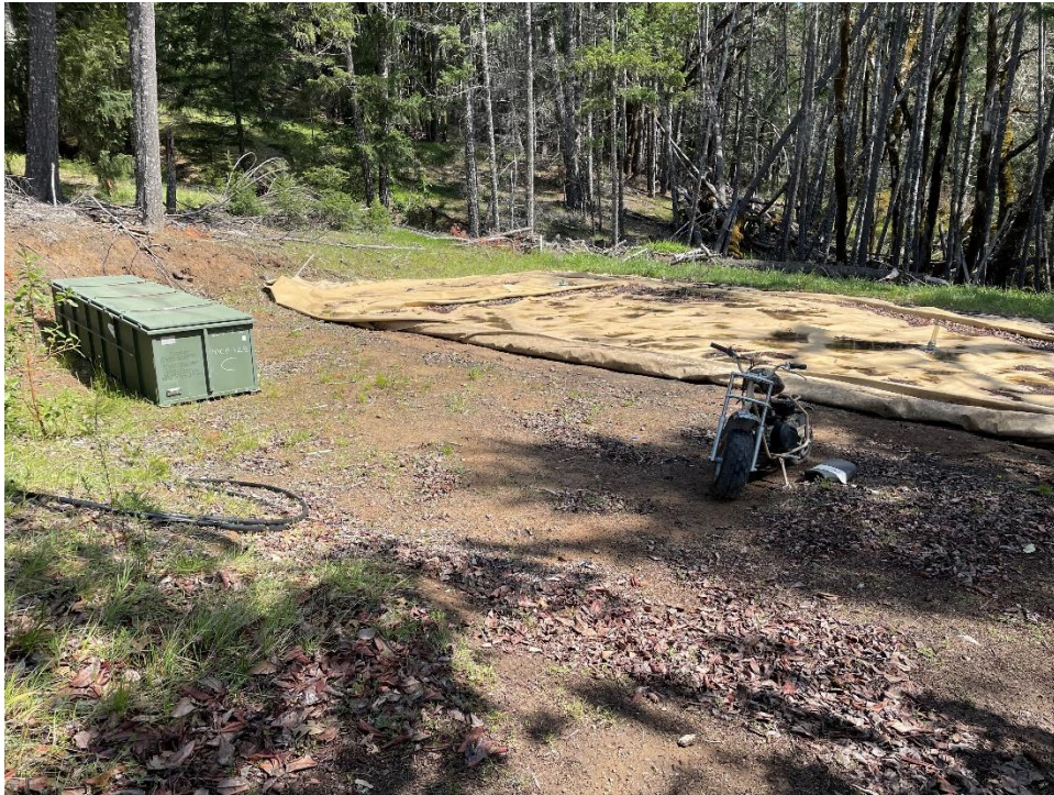
Photo 3. Location for GH 11 and 12 on graded water bladder flat.