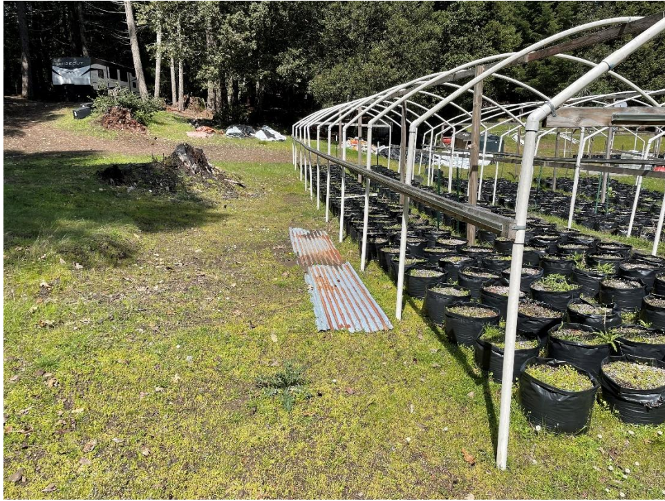
Photo 1. Location of GH6 adjacent to GH5 showing typical non-native herbaceous vegetation in areas disturbed by cultivation activity.