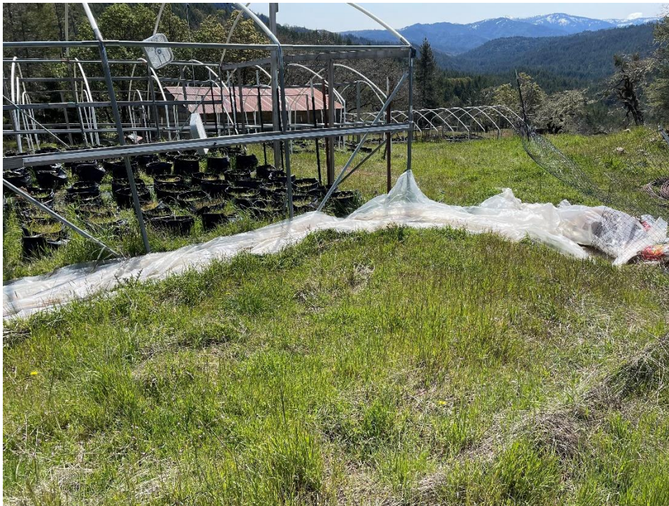
Photo 2. Greenhouse 10 (GH 8 in background) with similar non-native vegetation on graded flat.