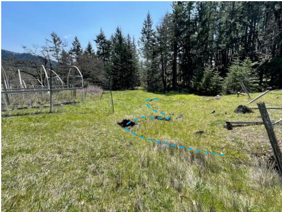
Photo 4. Southwest corner of site 18 (remediation site) in SMA for Class III watercourse.