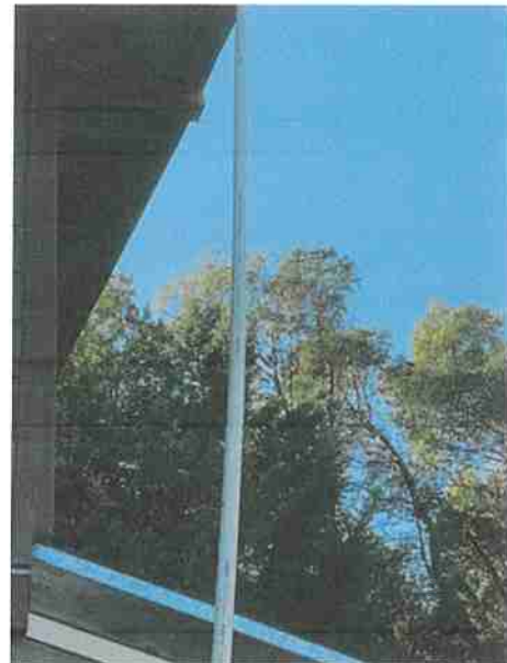
Rain gutter on east side of roof and drain pipe down to irrigation line