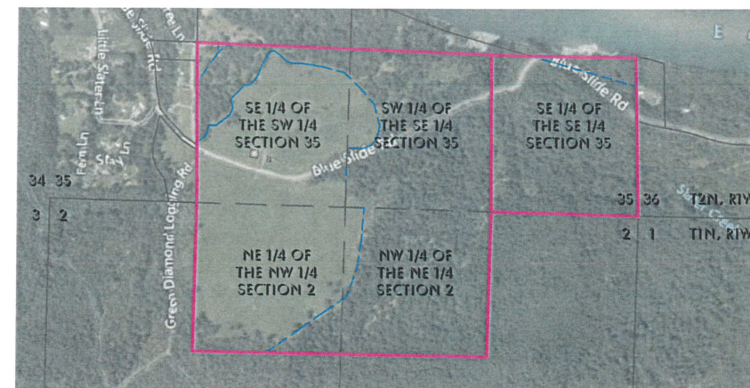
Current Legal Parcel Configuration