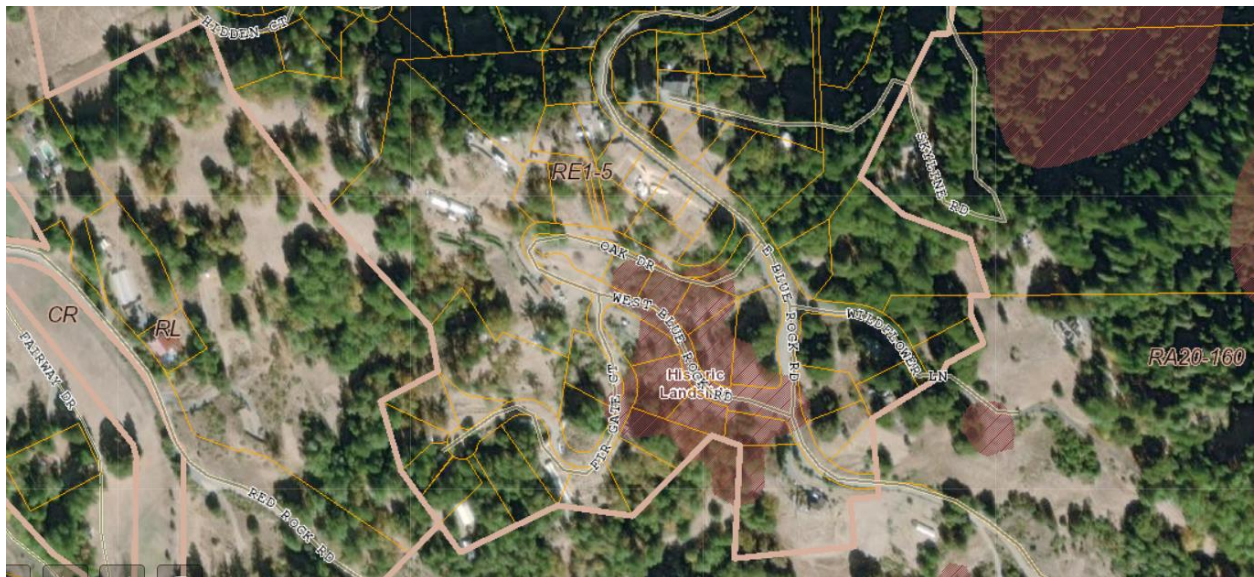
FIGURE 3 - HISTORIC LANDSLIDES AND LAND USE DESIGNATIONS

Project Area contains historic landslide feature