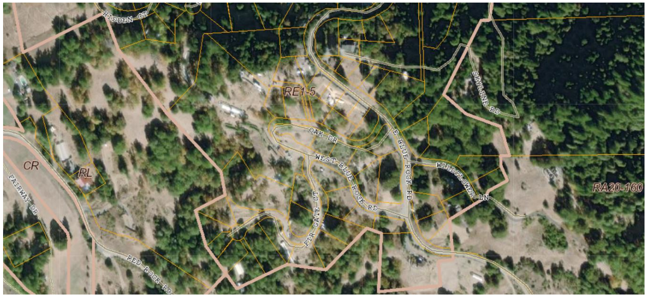
FIGURE 4 - 2019 RHNA HOUSING INVENTORY AND LAND USE DESIGNATIONS