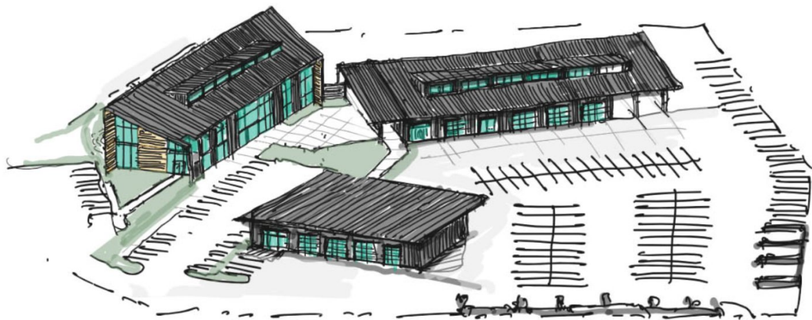
Figure 2. Conceptual Site Layout

If City Council approves the acquisition, the City's existing corp yard would be relocated to the new facility, which would also include administrative offices and serve as the City's emergency operations center during critical incidents, emergencies, and natural disasters. Based on the conceptual site layout included in the IS/MND, the operations complex would have a maximum development footprint of approximately 210,000 square feet (4.8 acres), which would include an operations building, warehouse, fleet maintenance shop, and surrounding hardscape (Figure 2). Approximately 66 full-time and seasonal Public Works staff members who currently work at the existing corp yard and City Hall would be stationed at the new facility.