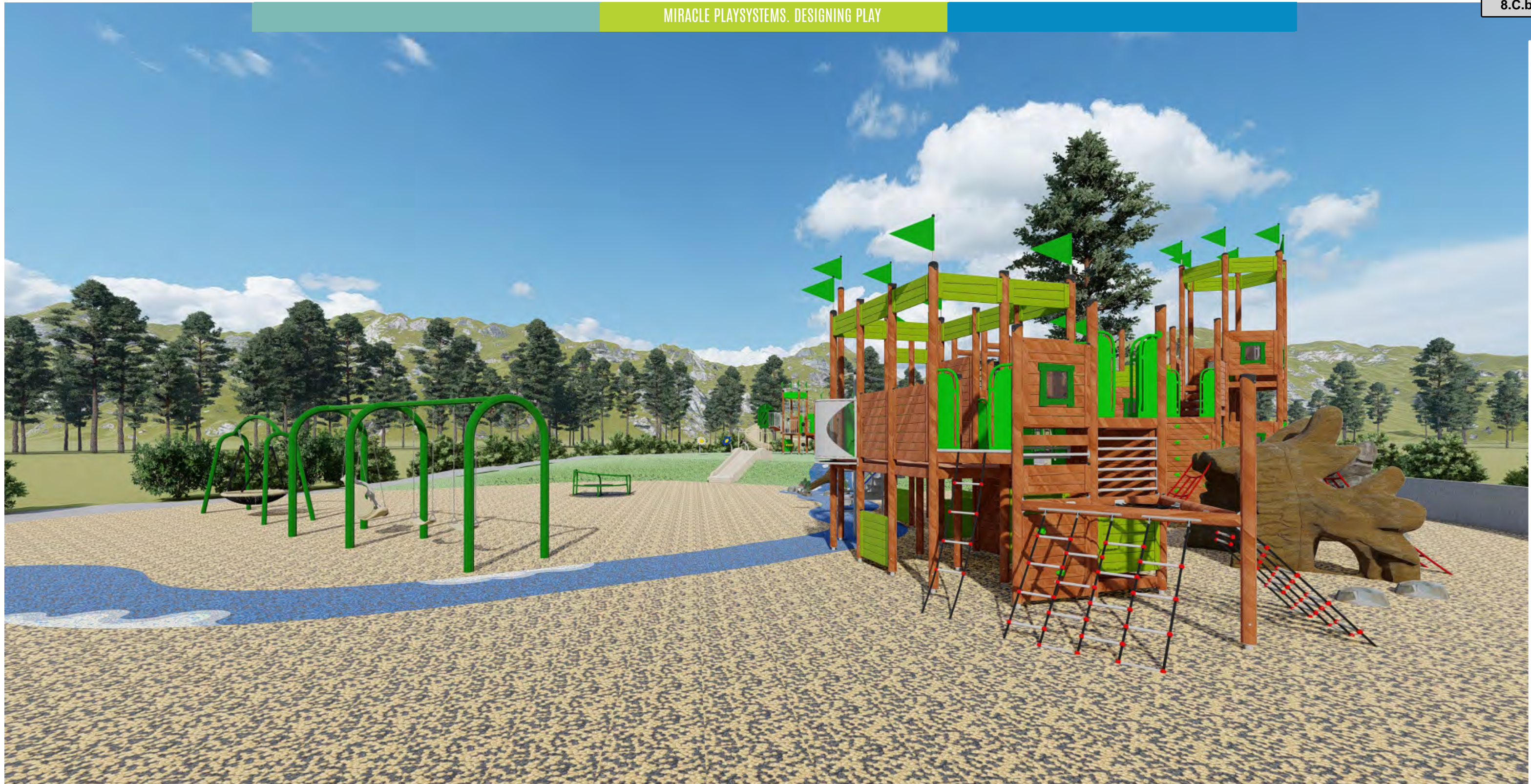
5-12 Play Yard

*Colors shown in rendering are for illustrative purposes only. Actual color and pattern may vary slightly.