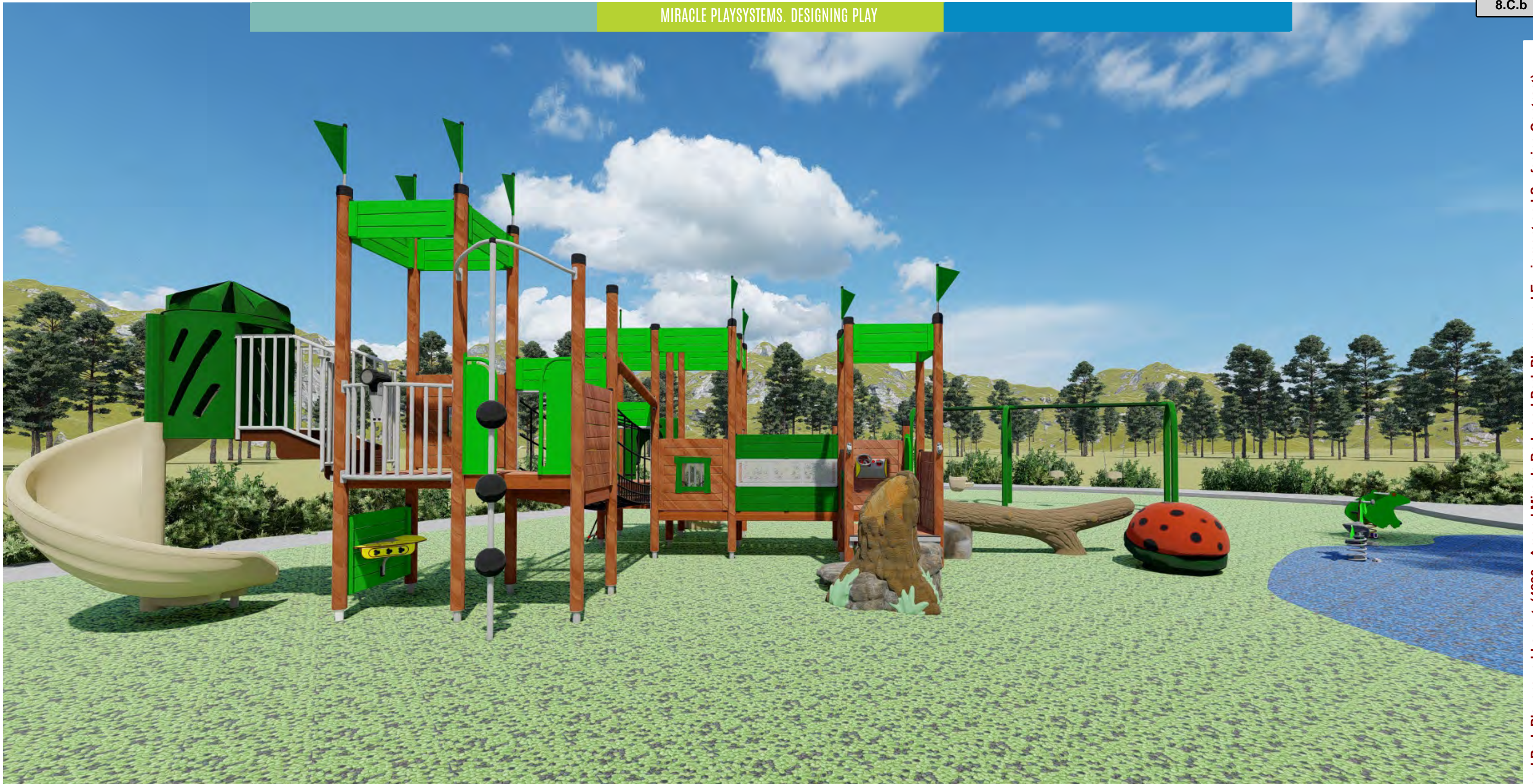
2-5 Play Yard

*Colors shown in rendering are for illustrative purposes only. Actual color and pattern may vary slightly.