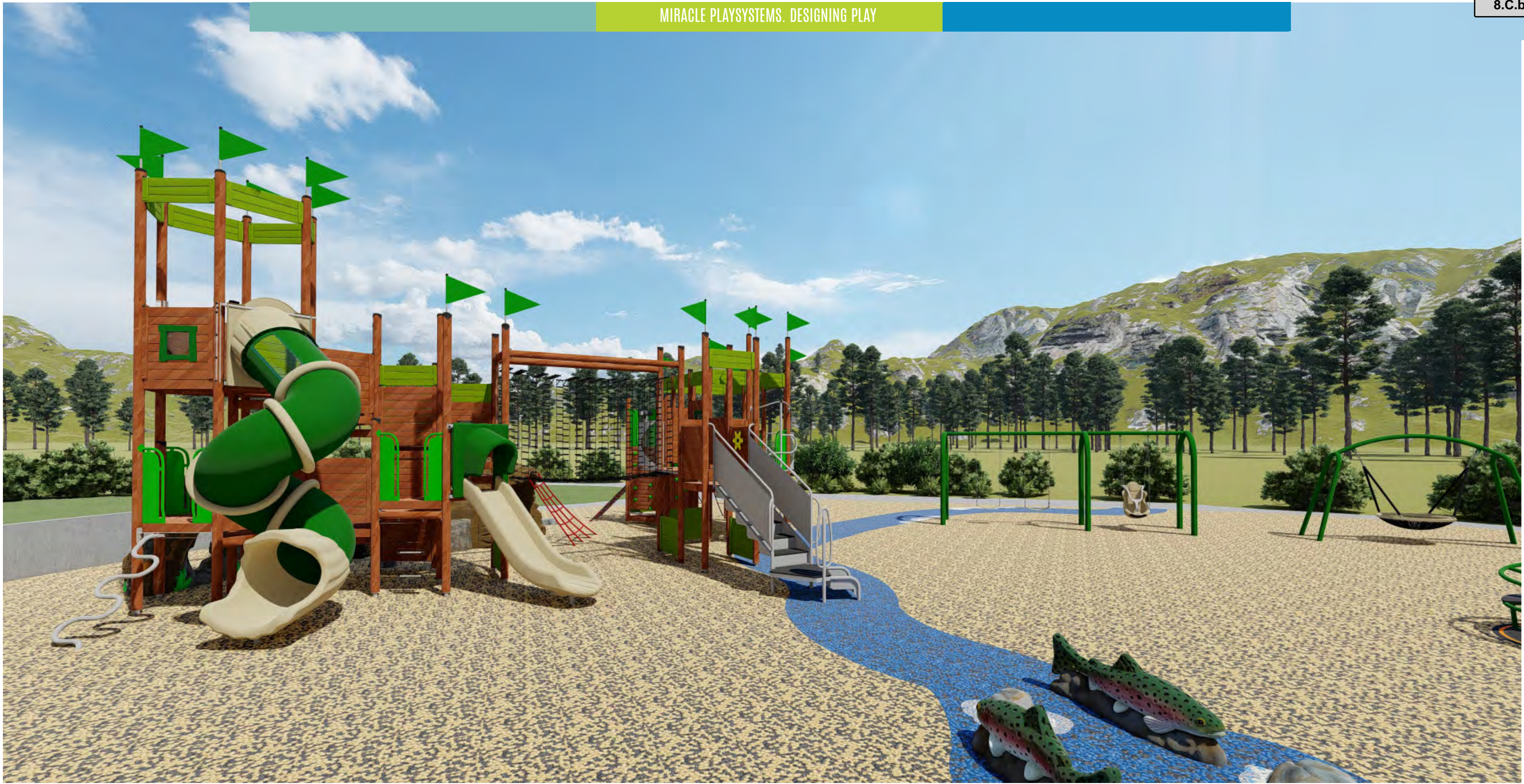
5-12 Play Yard

*Colors shown in rendering are for illustrative purposes only. Actual color and pattern may vary slightly.