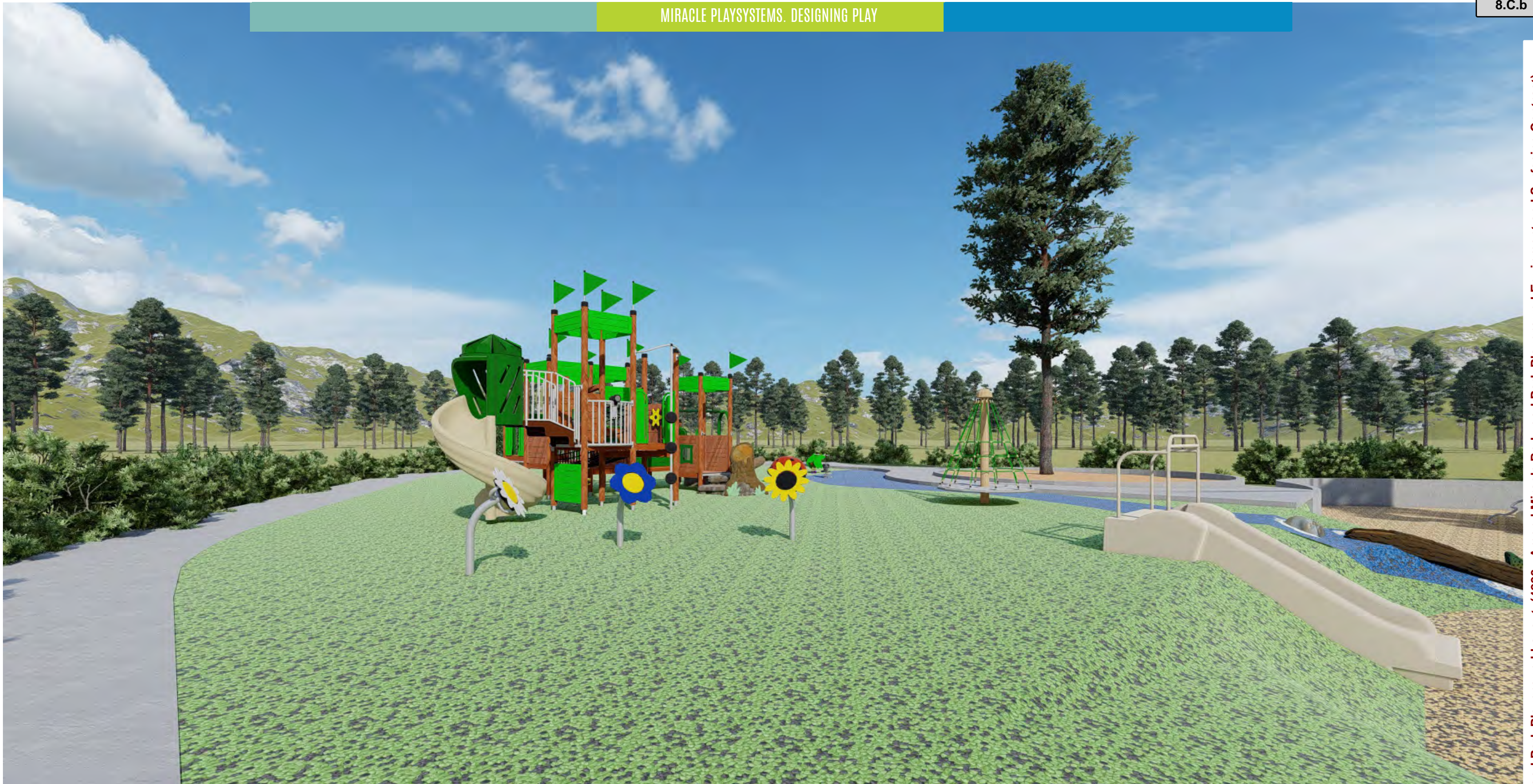
2-5 Play Yard

*Colors shown in rendering are for illustrative purposes only. Actual color and pattern may vary slightly.