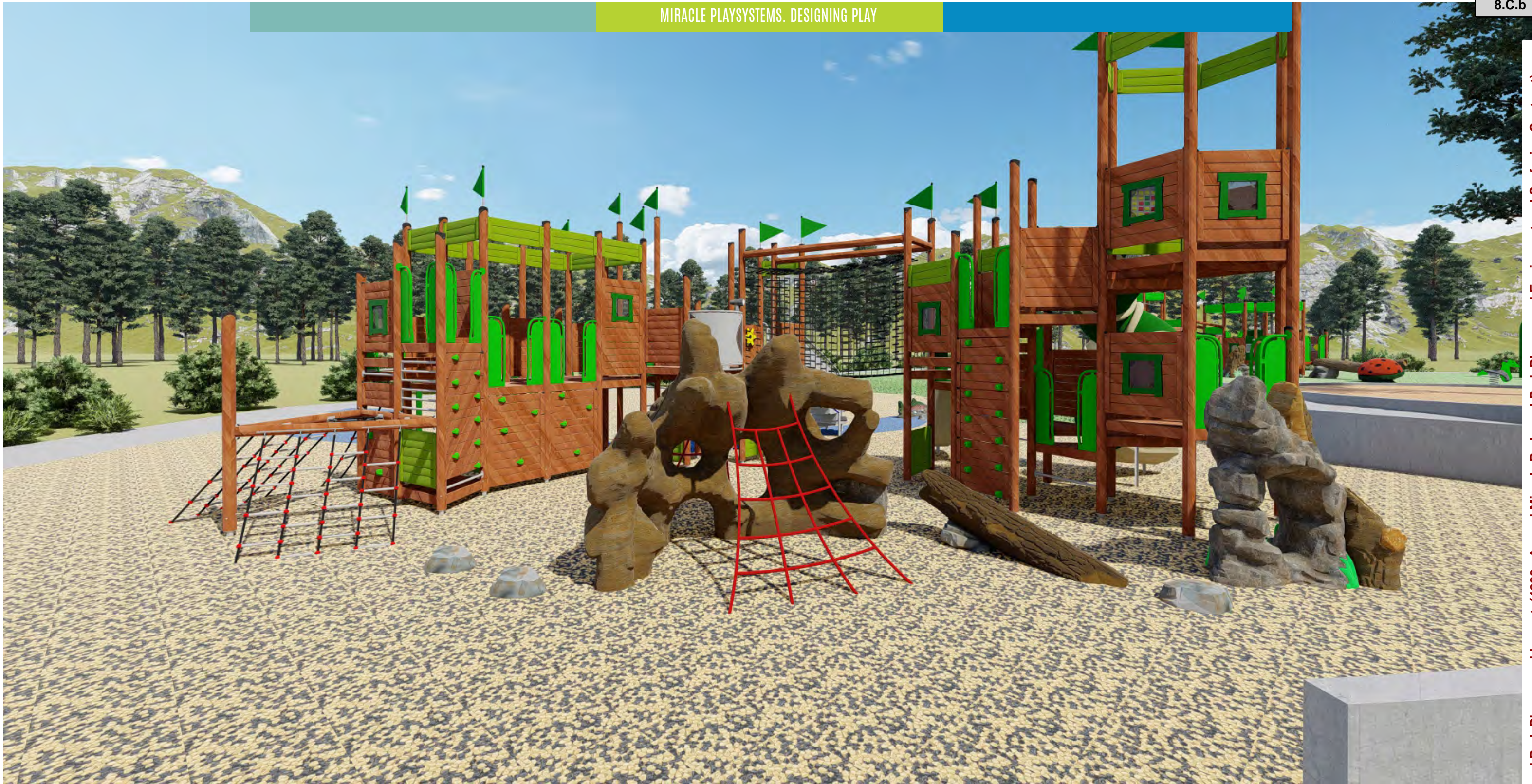
5-12 Play Yard

*Colors shown in rendering are for illustrative purposes only. Actual color and pattern may vary slightly.