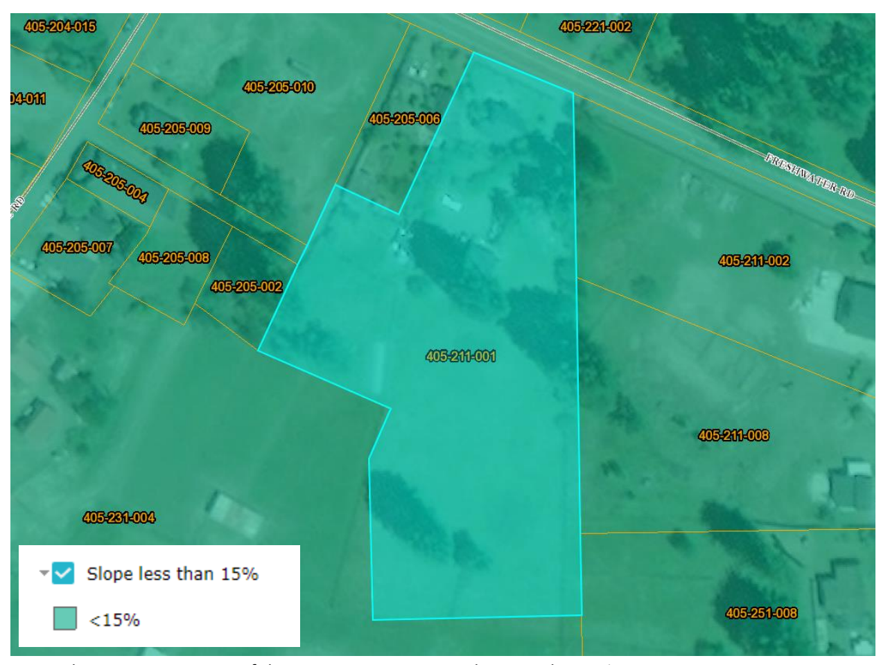
FIGURE 1 - SLOPE MAP

Note: The entire 2.30 acres of the Project Area contain slopes under 15%