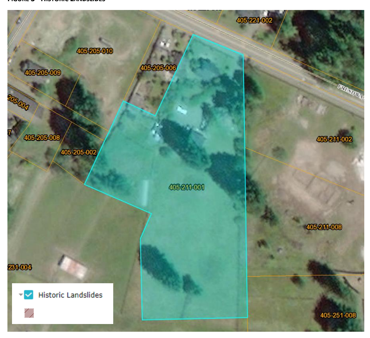
FIGURE 3 - HISTORIC LANDSLIDES

Note: The Project Area does not contain historic landslides