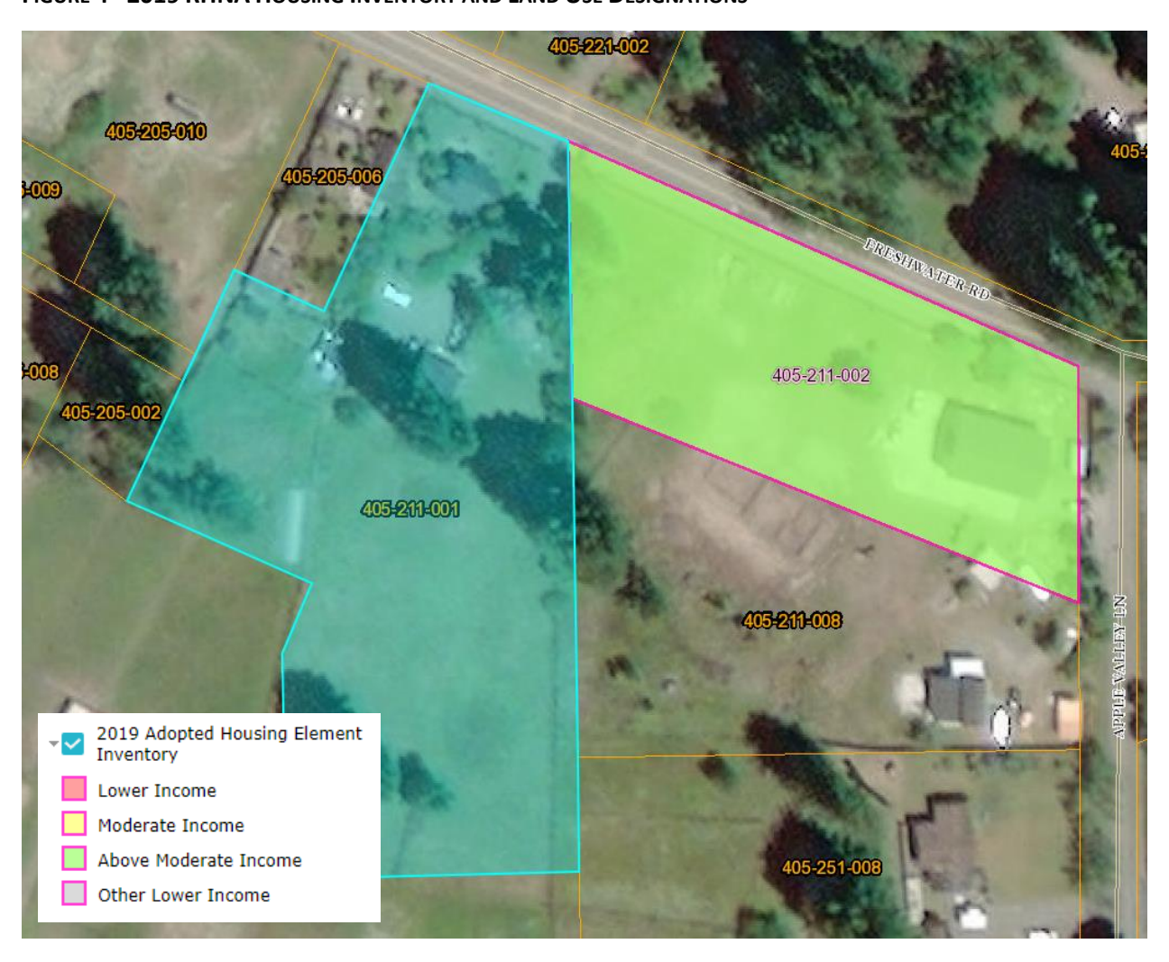
FIGURE 4 - 2019 RHNA HOUSING INVENTORY AND LAND USE DESIGNATIONS

Note: No RHNA Land Inventory sites are located within Project Area