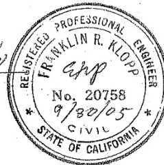
Exhibit A - Page 4

Franklin R. Klopp 12/20/05 Franklin R. Klopp, RCE 20758 License expires 09/30/05