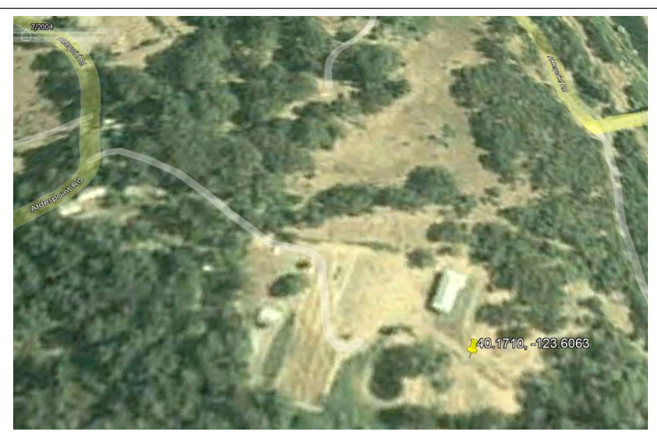
Figure 3 - 2004 Satellite Image