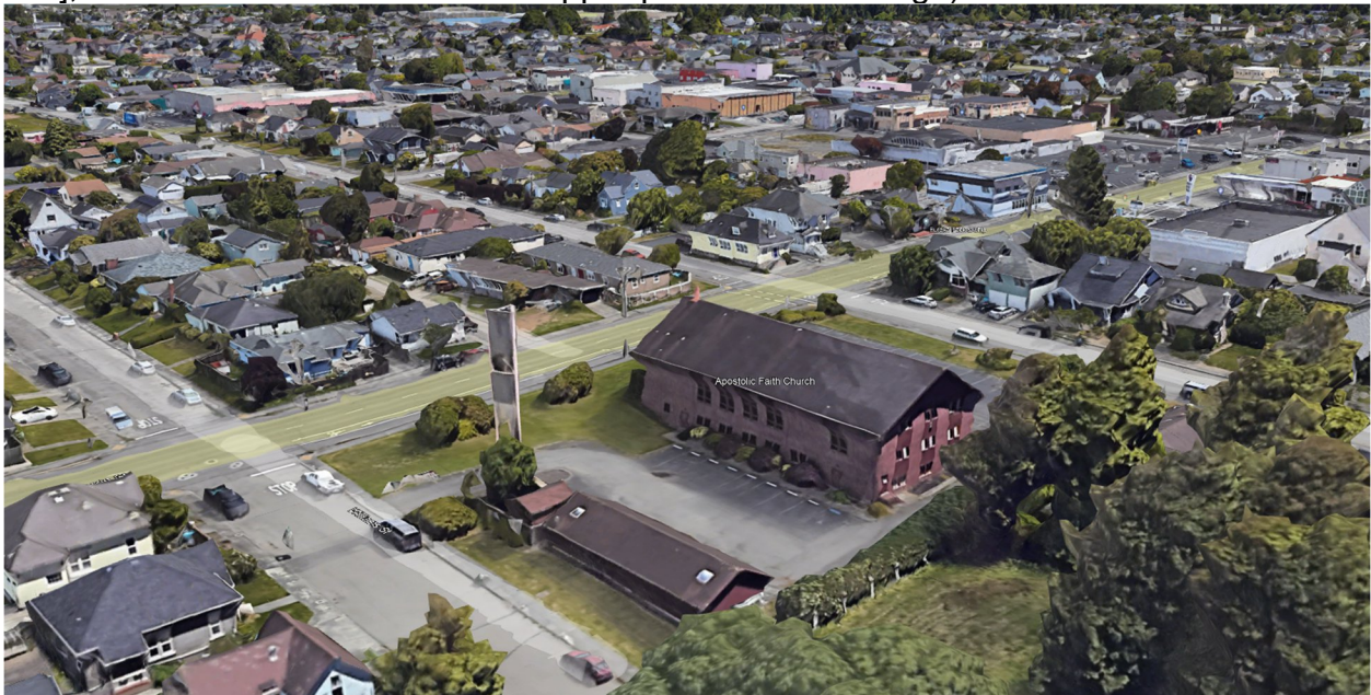
Figure 1: Vicinity Map (looking to the northeast at 272 Harris Street [vacant church site]; Henderson Center is seen in upper portion of the image)

The requested land use/zoning designation changes to NC/HC would allow for development of the Applicant's proposed Harris Medical Center (Figure 2), which includes converting the existing church building into an urgent care facility, rural healthcare clinic, medical spa, and associated office space (with remodeling/demolition as necessary); constructing 8-10 dwelling units within two new two-story residential structures and up to two dwelling units within the existing church building; constructing \pm 1,600 sq. ft. of new commercial space for a café; and associated site improvements, including demolition of an existing garage building. The existing cell tower will not be modified and will continue to operate as is.