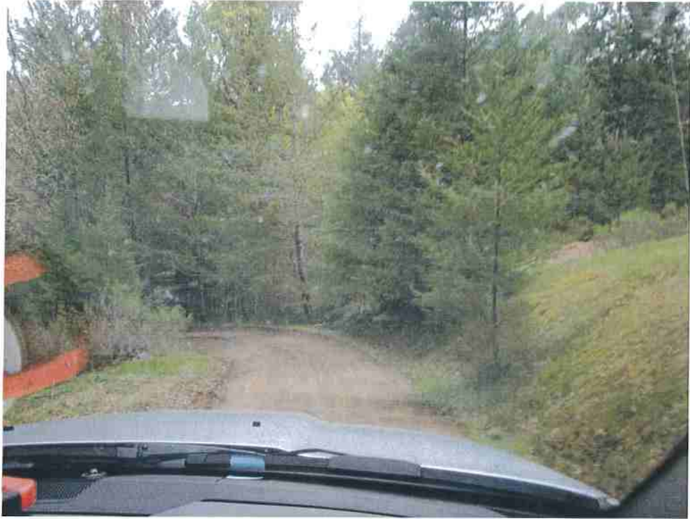
Mile 1.7 (Road A)