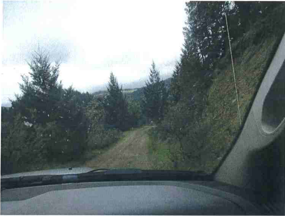
Mile 1.1 (Road A)