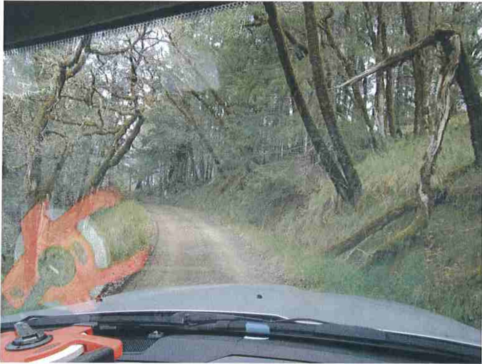
Mile 1.4 (Road A)