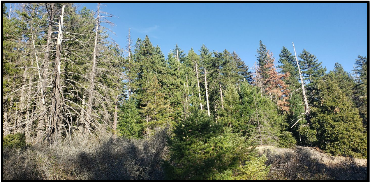
Mixed-conifer stand with dead, diseased, and dying trees—slated for treatments.