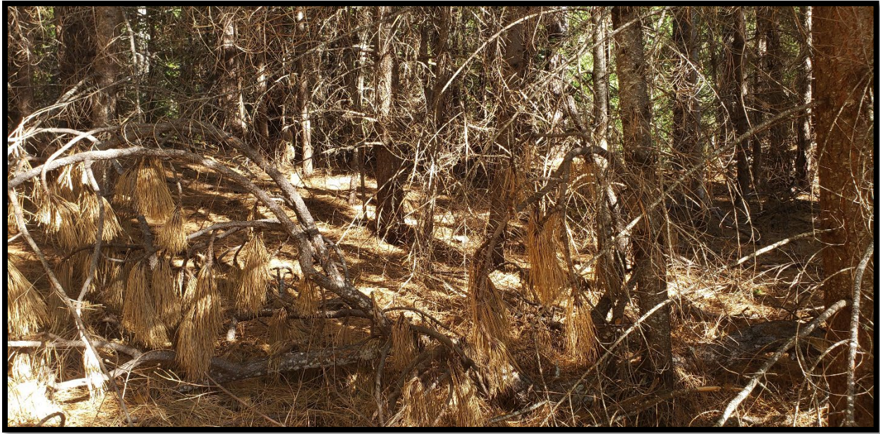
Removal of dense understory fuels is a top priority for the project.