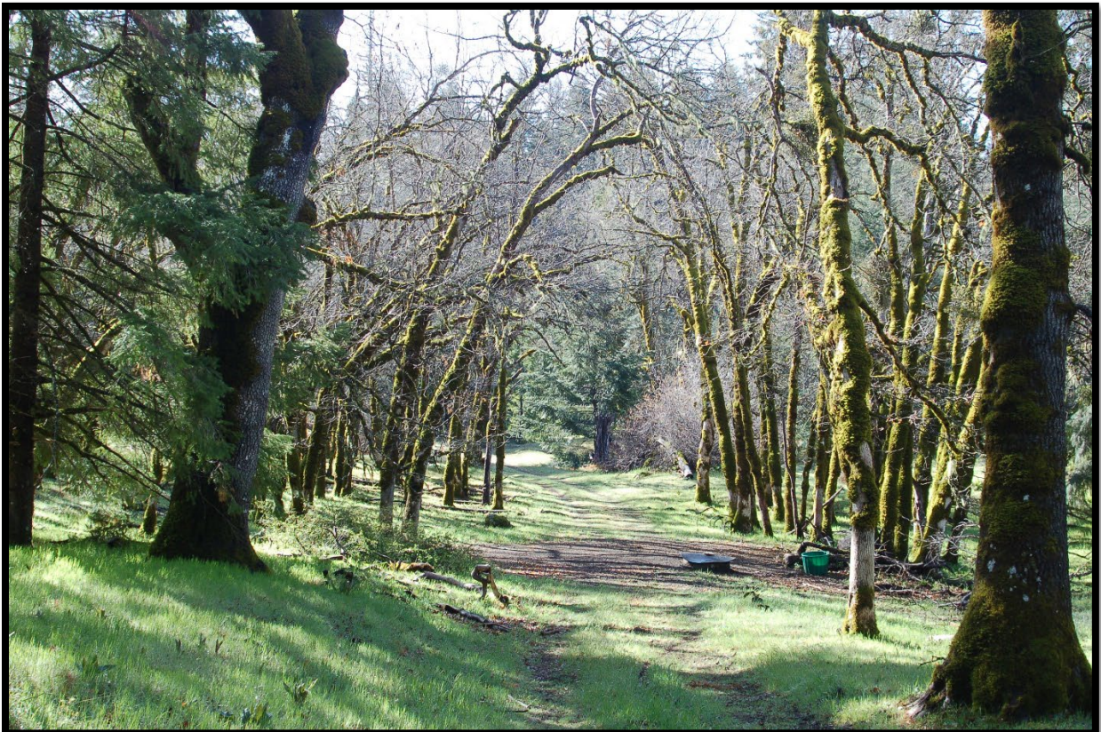
An Oregon white oak and California black oak woodland with modest Douglas-fir encroachment.