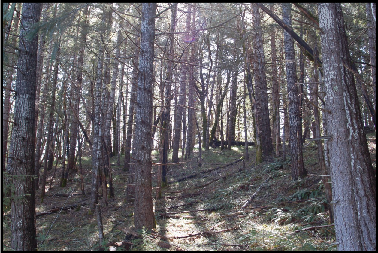
A dense Douglas-fir/hardwood slated for thinning.