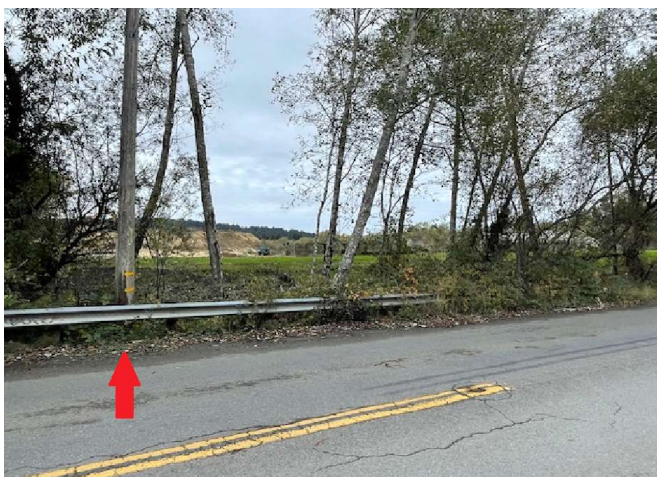
2011 Google Street View