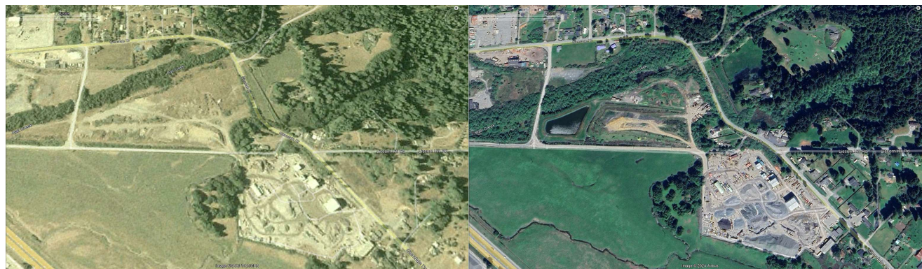
2004 Satellite Image

A Special Permit (SP-00-65) was approved to address unpermitted filling of wetlands in the northern yard area (APNs 516-151-008, -016 and -017). The mitigation for this included creating new wetland areas to compensate for loss of wetland areas filled without permits and enhance the overall quality of the new wetland areas by excavating down through the old deck rock mantle to natural ground and planting native wetland plant species in the areas. The work was completed in accordance with an ACOE 404 Permit and a CDFG Wetland Mitigation and Riparian Buffer Mitigation Plan. The remaining yard was then permitted to be utilized for soil stockpiling and some material storage. The image below on the left is from 2004, shortly after the completion of most of the mitigation, and the image on the right is from 2023. Both the upper (southern) yard and the lower (northern) yard are visible and in use. The approved site plan shows this area vaguely at Soil/Gravel Yard (Attachment 3b.) In the image on the right an unpermitted stormwater impoundment feature can be clearly seen.