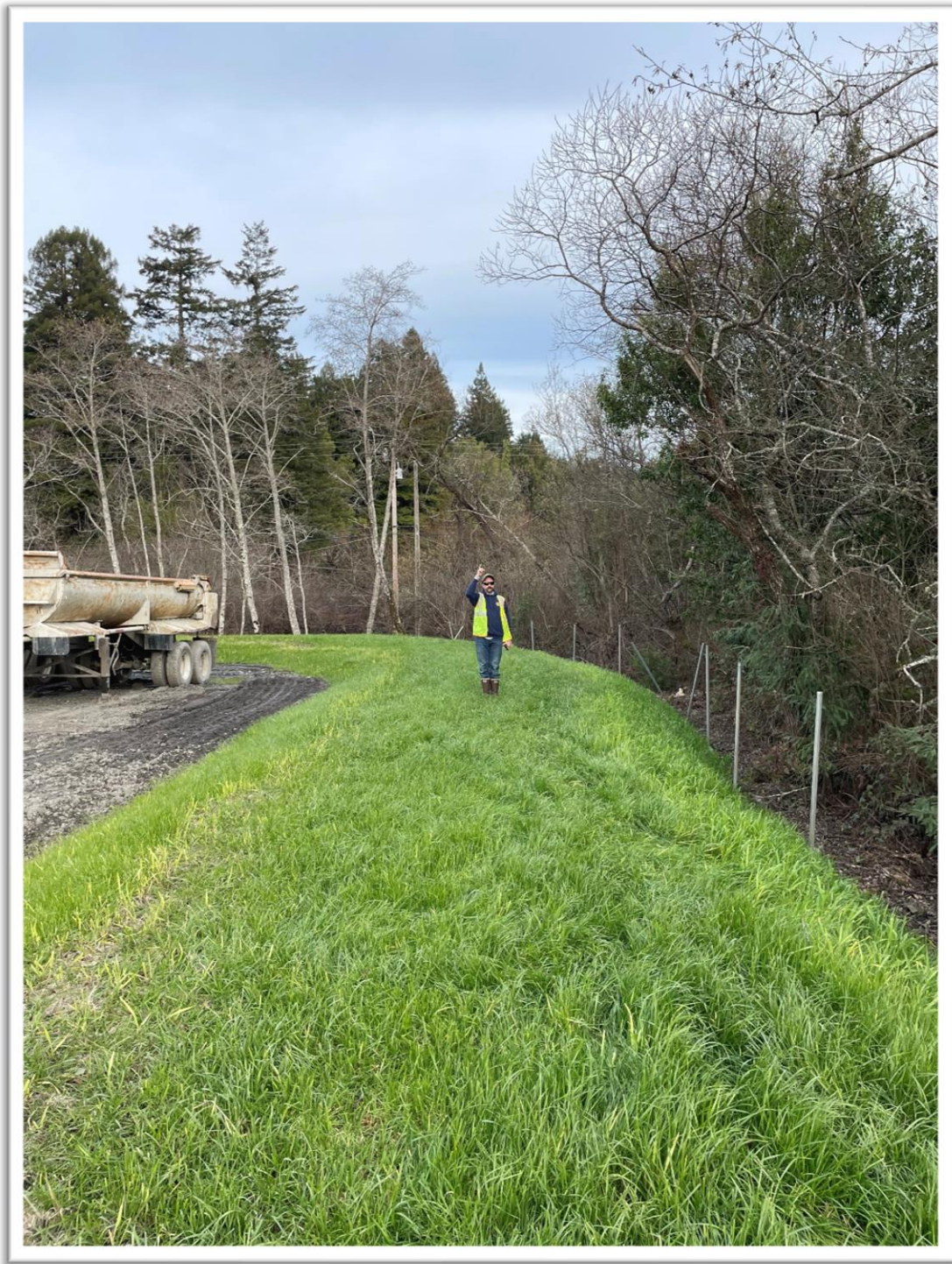
Figure 4. The dripline of the existing riparian canopy of Noisy Creek extends beyond the streamside edge of the berm, documented during the January 30, 2025, survey effort.