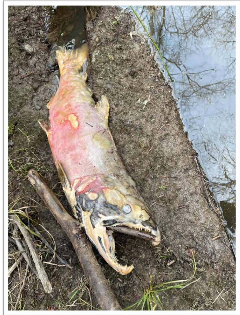
Figure 5. Carcasses of adult female (left) and male (right) coho salmon ( Oncorhynchus kisutch ) observed in Noisy Creek during the January 30, 2025, survey effort.