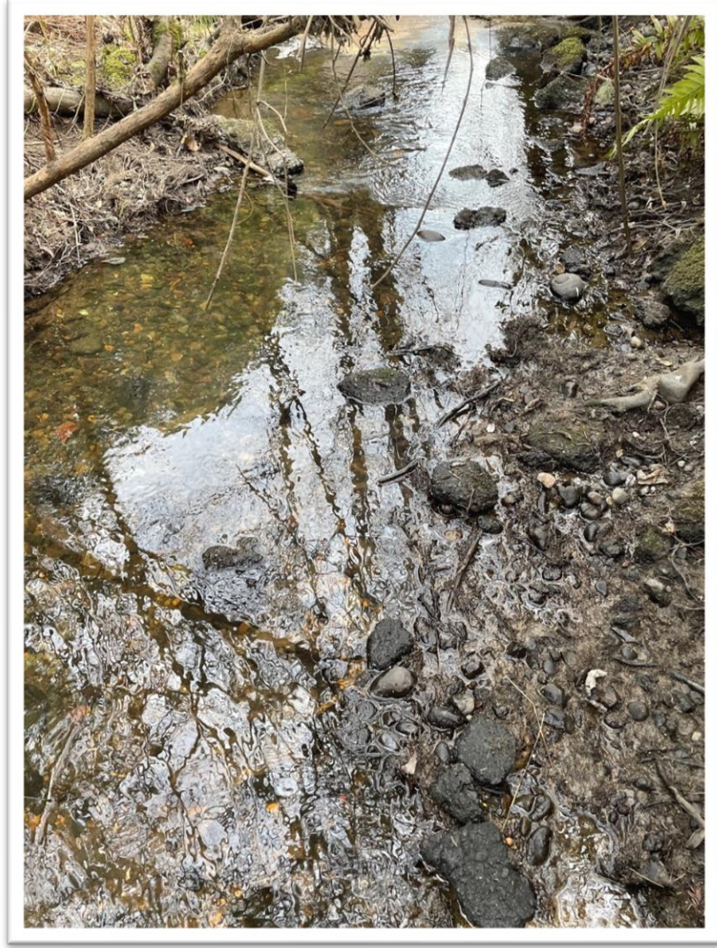
Figure 6. Concrete and asphalt debris in the channel and streambed of Noisy Creek, observed during the January 30, 2025, survey effort.