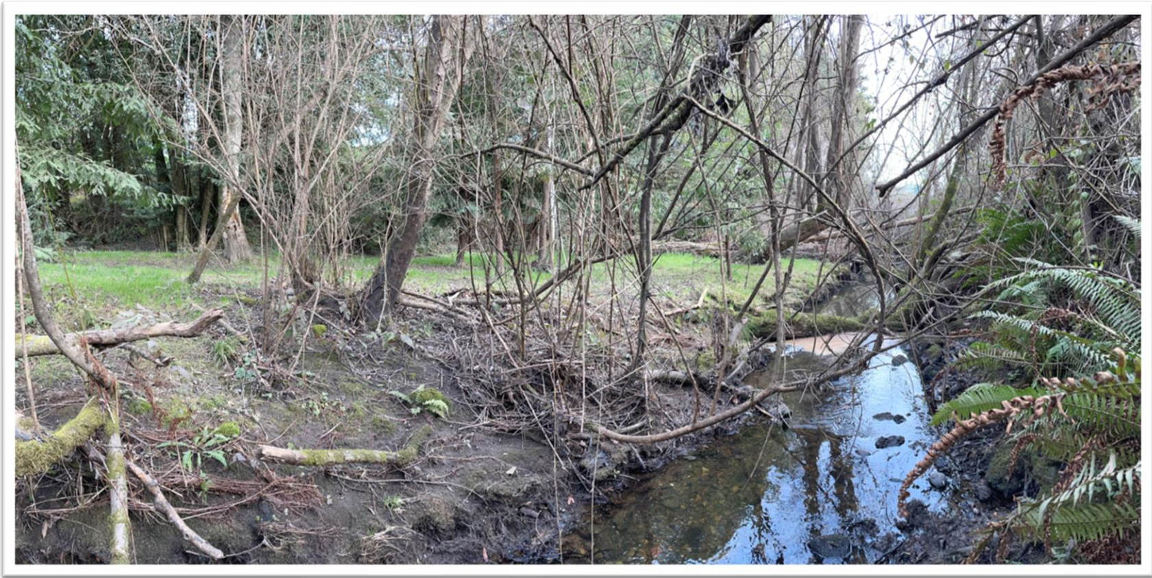
Figure 3. Floodplain terrace along the left bank (eastern side of Noisy Creek, with an overstory of red alder and willow. The understory shrub and herbaceous layers were sparse compared to the western bank (right).