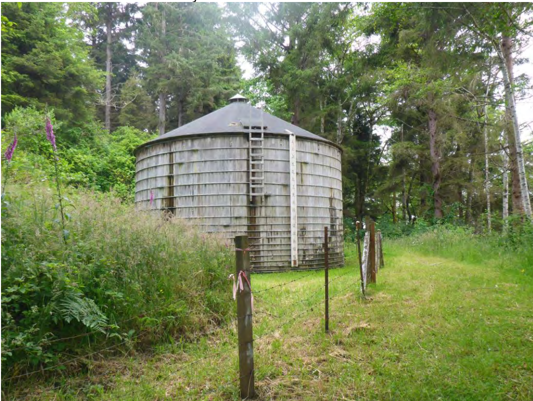
Water tank to be replaced, view to southwest