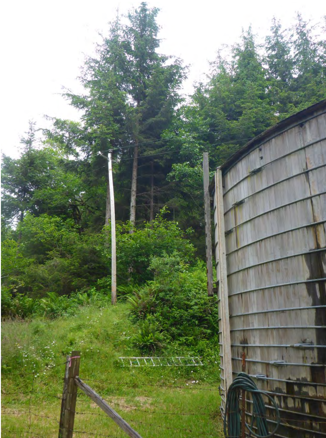
Power pole(center) to be replaced with taller pole, view to east-northeast.