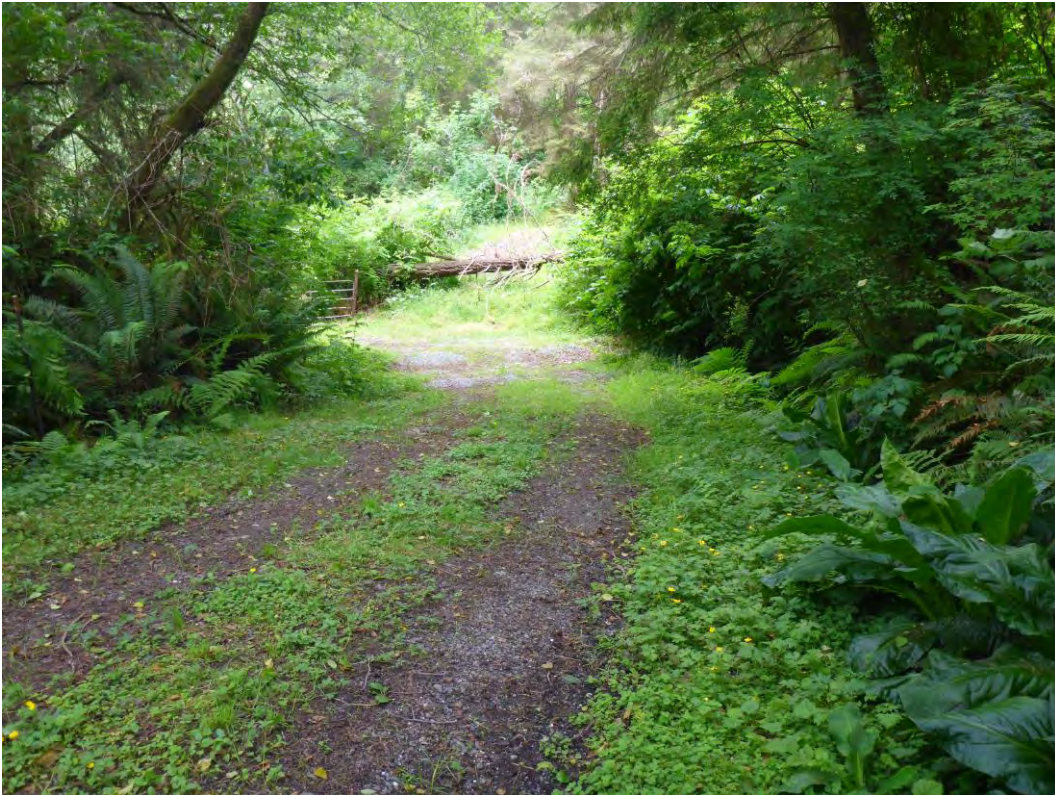
Driveway to tank site. The created roadside ditch is on the right; a natural stream crosses under the driveway near its bend. View to northeast.