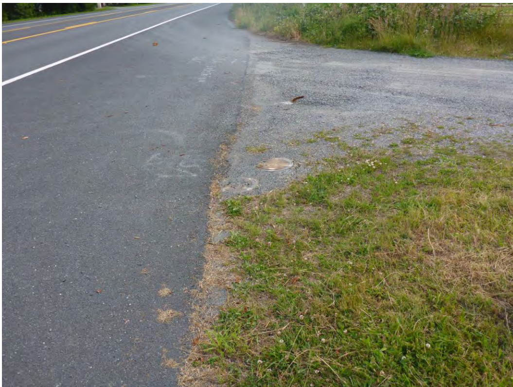
Valve cluster to be replaced near Presbyterian Church, view to south-southwest.