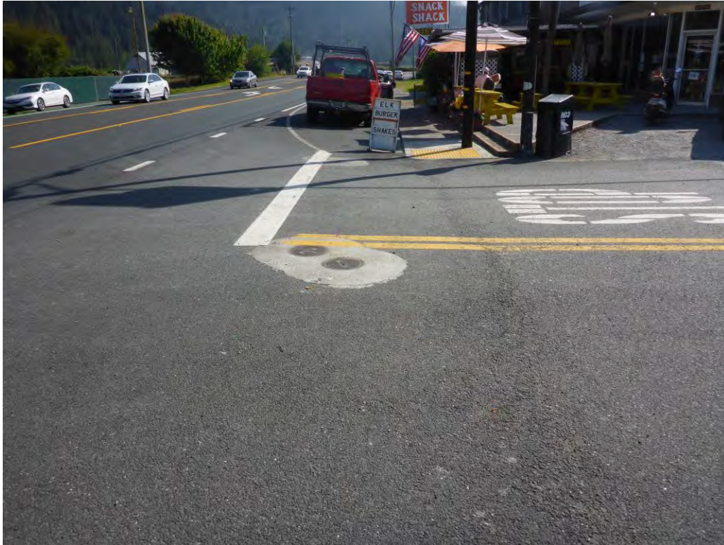
Valve cluster to be replaced near Hargood's Hardware Store, view to southwest.