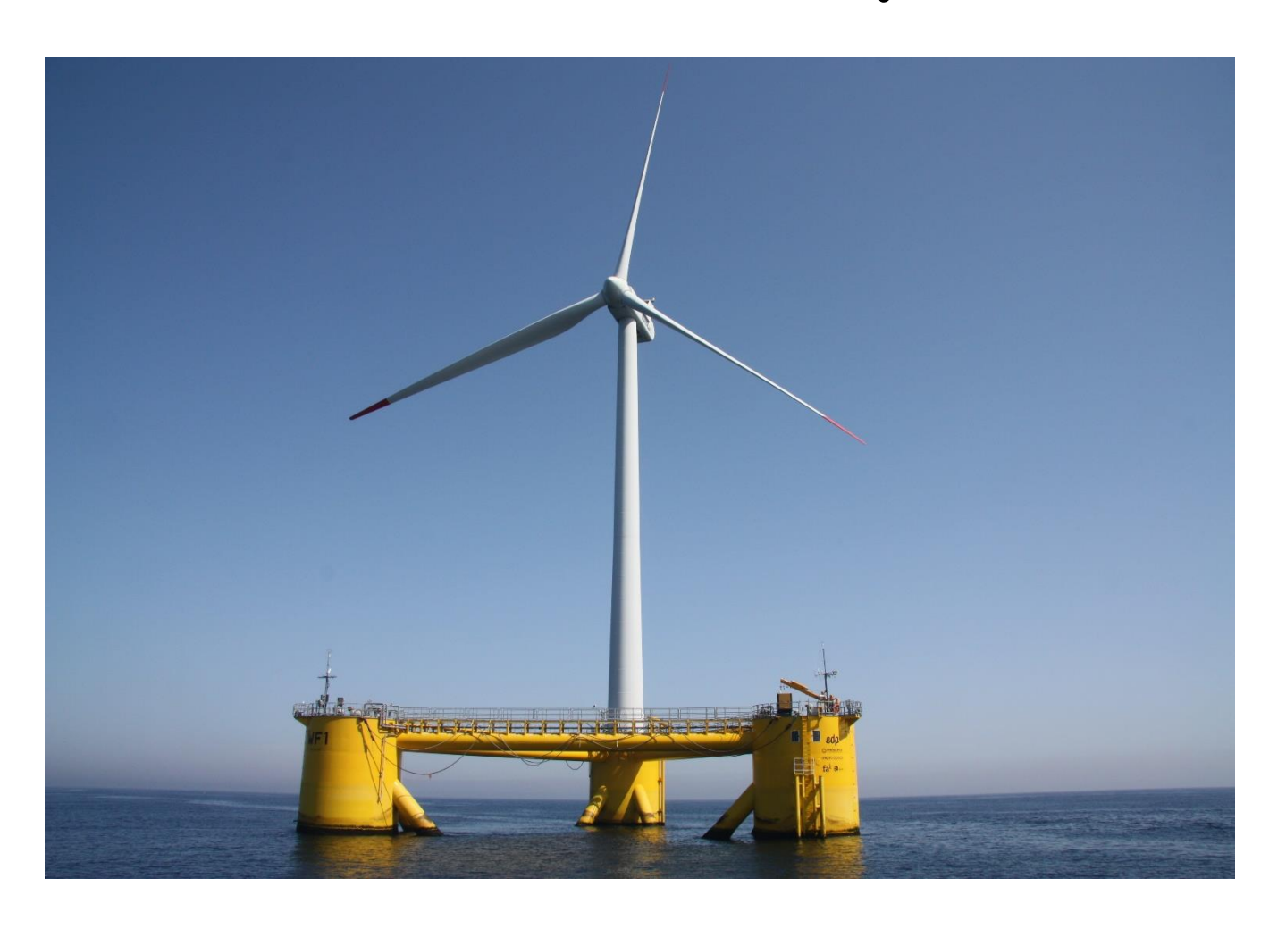
2023 State and Federal Legislative Platform